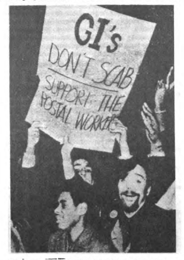
WORKERS APPEAL FOR ALLIANCE WITH GIS

There has to be someone to make sure bosses' orders and dirty work get done. A "chosen few" are given the chance to go to Officers Candidate School, where they are taught how to manage GIs. Most commissioned officers are college graduates, although a strictly limited number