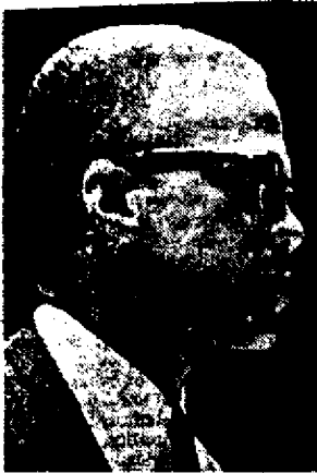
By Malcolm X