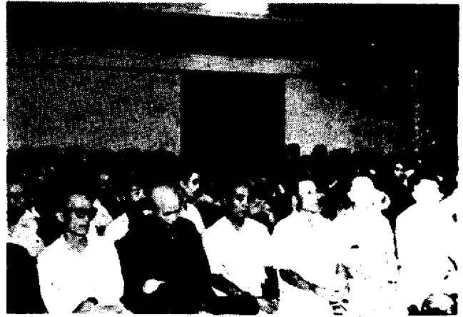
Vietnamese meet to support American Negro struggle

We of RAM know that in South Vietnam today, U.S. imperialism is trying to fill the vacuum left by the Indochinese rout of French imperialism ten years ago, as elsewhere in the world it is trying to fill the vacuum left by Britain, Holland, and the other European imperialist powers. We are well aware of the undeclared war that the forces of U.S. imperialism are