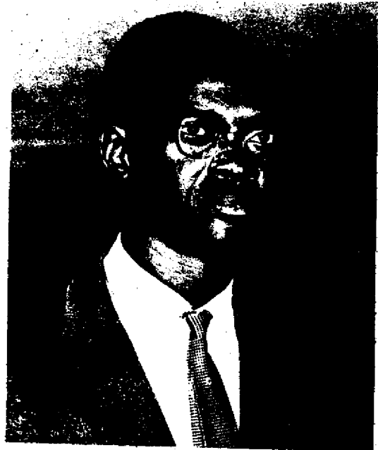
"Lest Ye Forget"

THERE AIN'T NO WAY IN HELL that I'm going out like a fool and fight my non-white brothers in Asia, Africa, and Latin America for "White Devils." In fact, I ain't going to risk my life fighting against your white enemies. I like to see "White-Eyes" killing each other for a change. And anyway, I support everything you oppose and oppose everything you support.