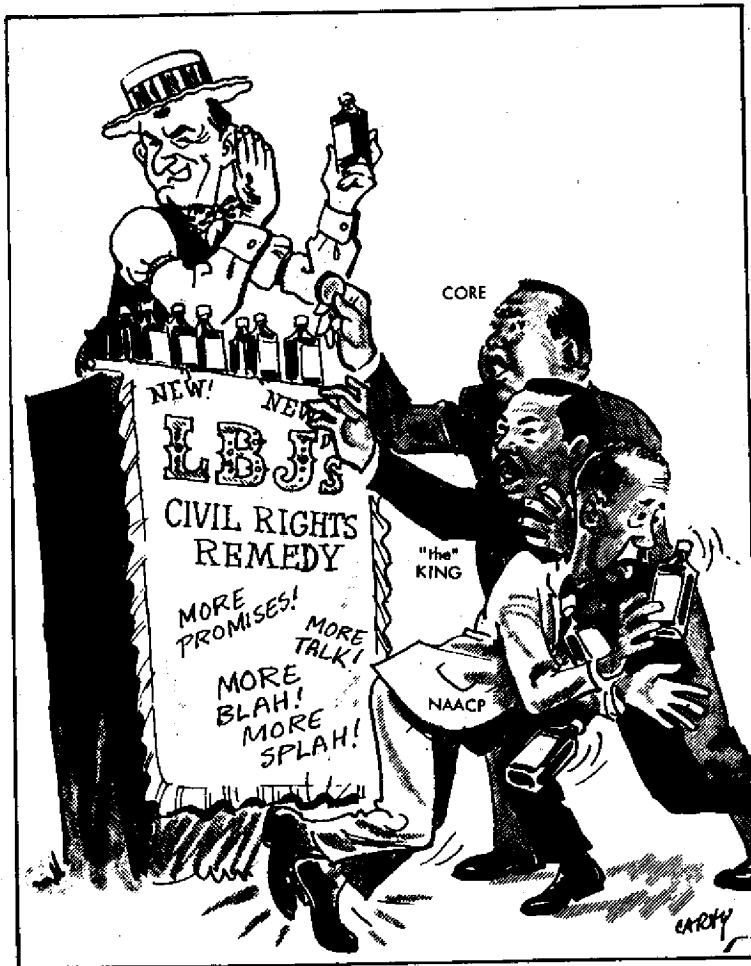
"THIS STUFF BEEN GOIN' LIKE HOT CAKES"

The role of the revolutionist is not to encourage others to become part of a system. It is to change the whole system. The aim of the revolutionist is not more Democracy or more Integration. It is to create a system which assures the equal right of all, regardless of race or class or nation, to live as full human beings. Today a revolution has taken place in technology which makes it possible to free man for the first time from the slavery of the work process and the machine and yet provide enough material goods for this country and some of the developing world, so that exploitation and domination of classes, races and nations are no longer necessary and universal citizenship can be a reality. But such a way of life cannot come by voting nor by wishing nor asking nor persuading nor praying. It can only come by the Revolution.