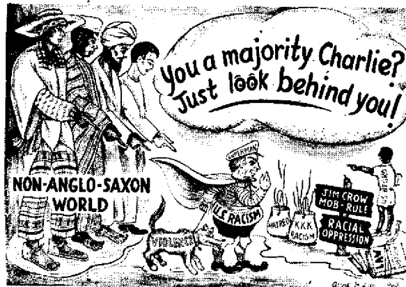
Robert F. Williams