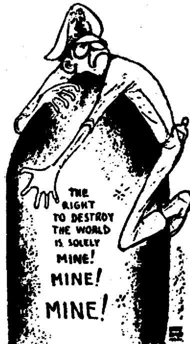
Pacific Tribune, Vancouver