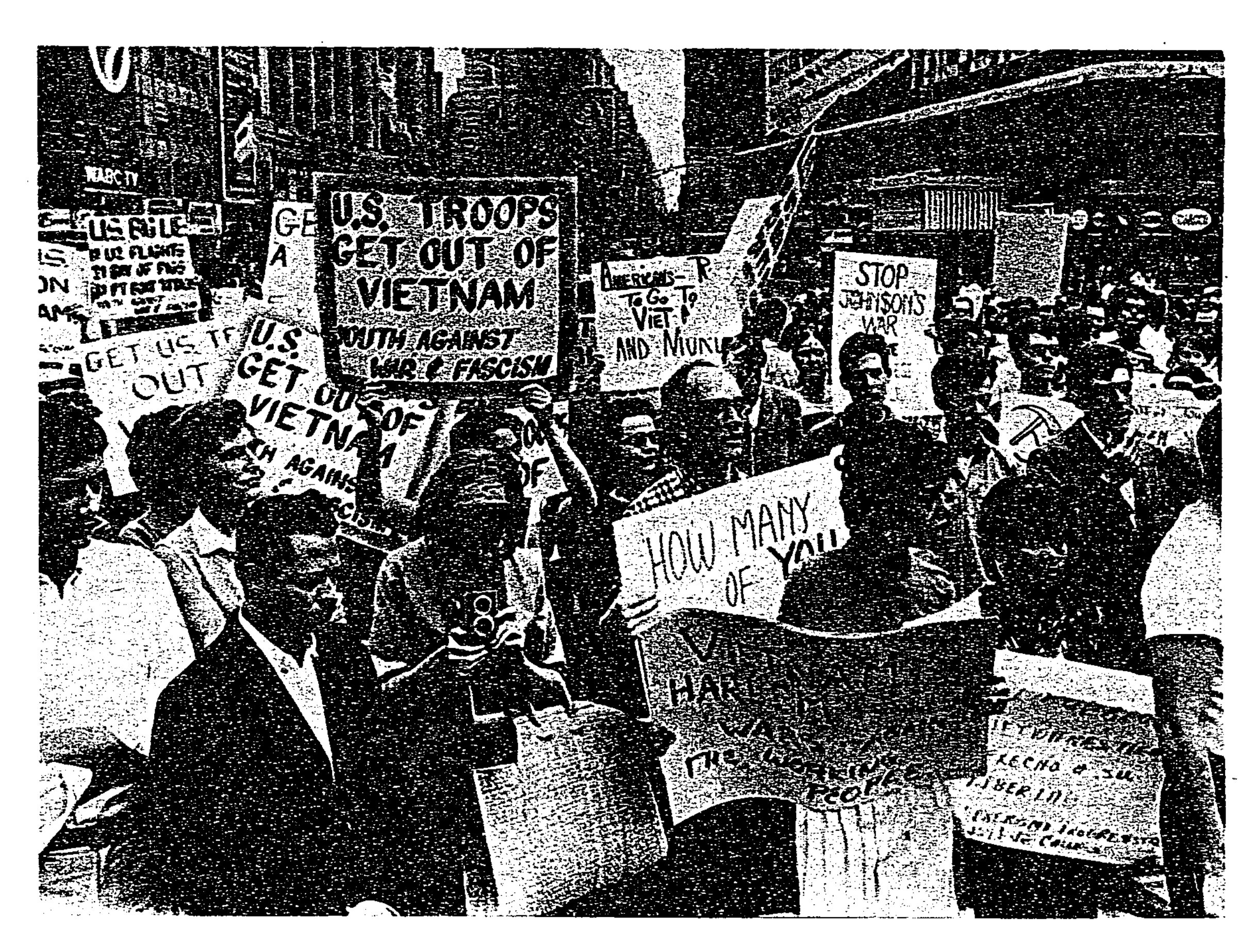
The new left wing is way far out-often in the direction of Mao. Here, a demonstration on Broadway.