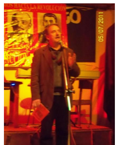
1Artes speaking in 2011

A split from the Revolutionary Communist Party led by Eduardo Artes saw the Communist Party / Proletarian Action (PC-AP) founded on November 8, 1979. It proved initially something of a Hoxhaist fragment; engaged with the international process coming out of the Quito declaration of Hoxhists parties, the ICMLPO/ the International Conference of Marxist-Leninist Parties and Organizations and its associated journal, Unity & Struggle .