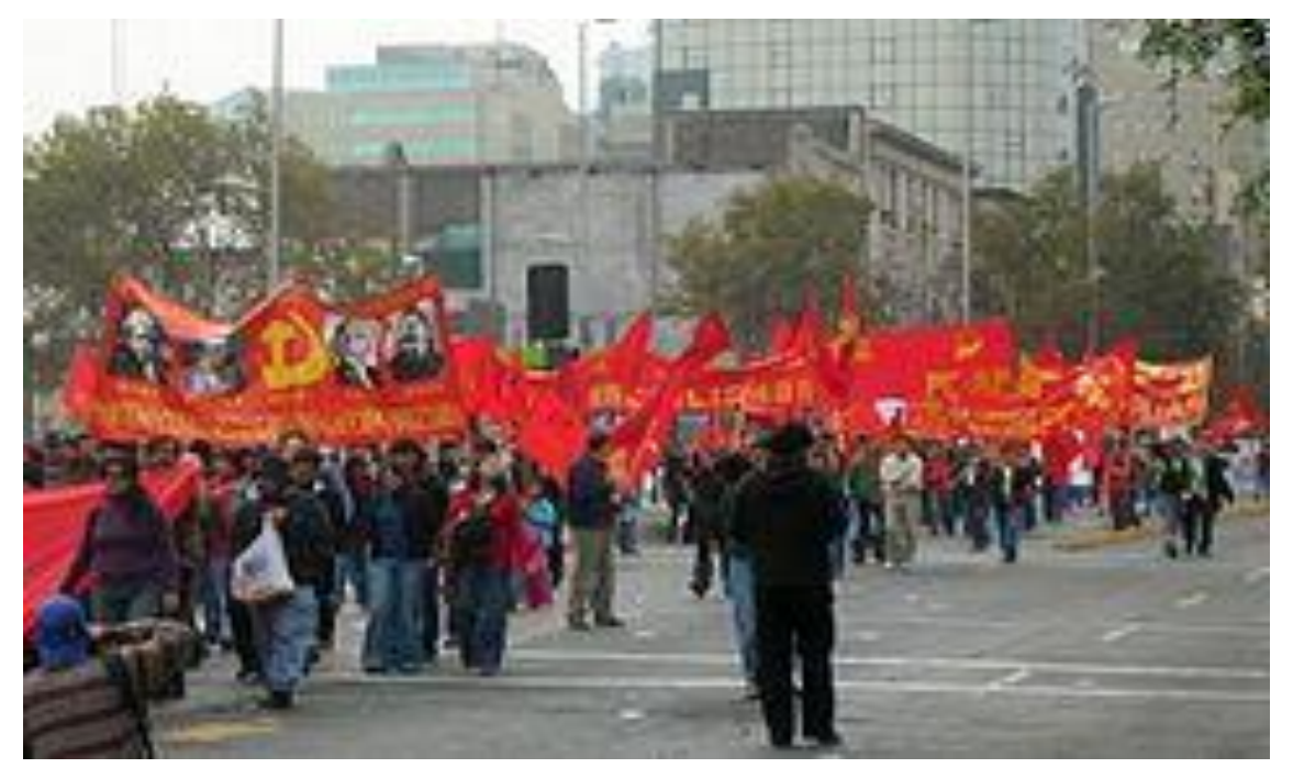
Figure 2 Mayday 2011 in Santiago , Chile

declares that it was officially taking the name of the Chilean Communist Party (Proletarian Action) after having considered that the movement had succeeded in the "phase of the construction of the Party of the working class".