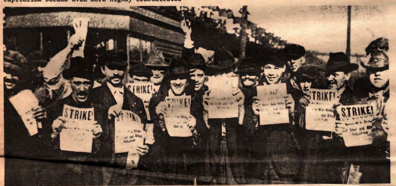
Steelworkers of 1919 stood up against the huge monopoly corporations, the government and the AF of L bureaucrats to demand an 8-hour day and the right to organize

And in one country the workers did just that In 1917 the Bolsheviks led a successful socialist revolution which inspired workers throughout the world Writing about the effect of the Russian Revolution on the steel strikers of 1919, the Interchurch World Movement wrote "They have a vague idea that big rich people who run things 'arbitrarily' even in mills, are coming down in the world Russia, moreover, means to them the rise of workingmen to power They have a vague idea that poor people who have been run for a long time, on farms and mills, are coming up in the world and are beginning to run themselves "★