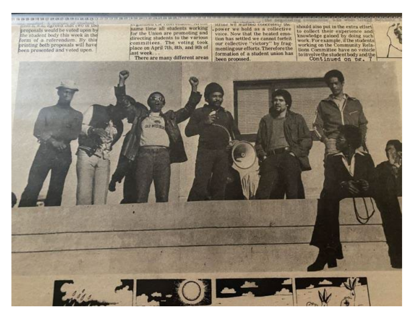
Members of El Comité in New York City.

Led "predominantly by working-class Puerto Rican activists" from Manhattan's West Side, El Comité developed organically—from an informal collective to a sophisticated Marxist-Leninist cadre organization with chapters in neighborhoods around New York City, on college campuses, and beyond (Muzio 40). Some of their signature achievements include the first successful district-wide campaign for bilingual education; legitimacy for gypsy cab drivers who went to pick up passengers where yellow cabs would not; a Latin Women's collective; protests of PBS which resulted in the show Realidades , a weekly television series on Latino life that lasted three years; co-hosting the first-ever conference on Puerto Rican political prisoners, which was organized with The Young Lords and the Puerto Rican Student Union at Columbia University; advocating for community control in education; and organizing a coalition of African-American and Puerto Rican construction workers for access to construction jobs in the Bronx.