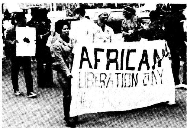
300 marched in New Haven

Demonstrations were also held in Antigua, West