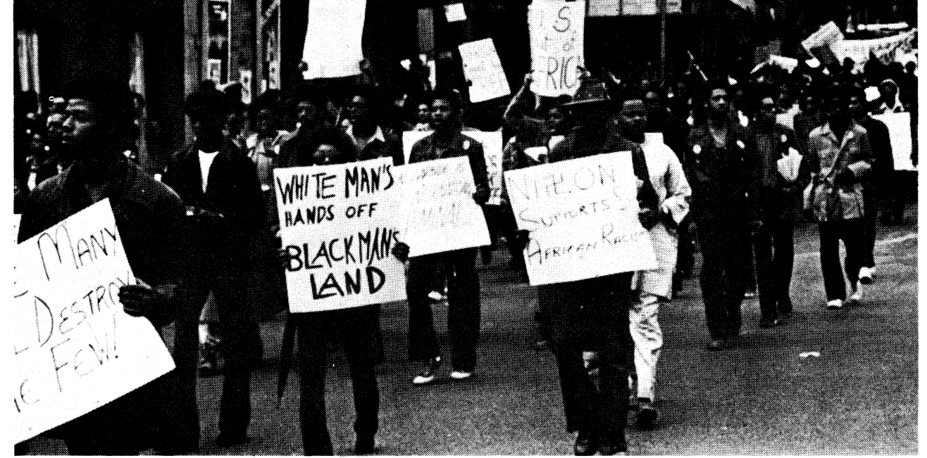
Part of the march of 3,000 in New York

ceeded. In New York, one marcher gestured to a brother leaning out the window of a large apartment building. He later told me, "When he saw all of us marching up the street, he must've done something because the next thing I knew about 20 or 30 dudes came flying out of there and joined us."