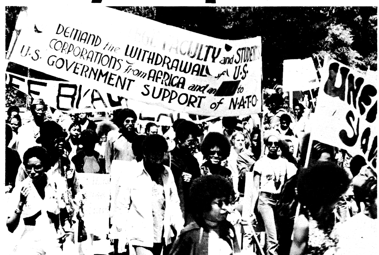
Merritt College contingent in Oakland, Calif., African Liberation Day action