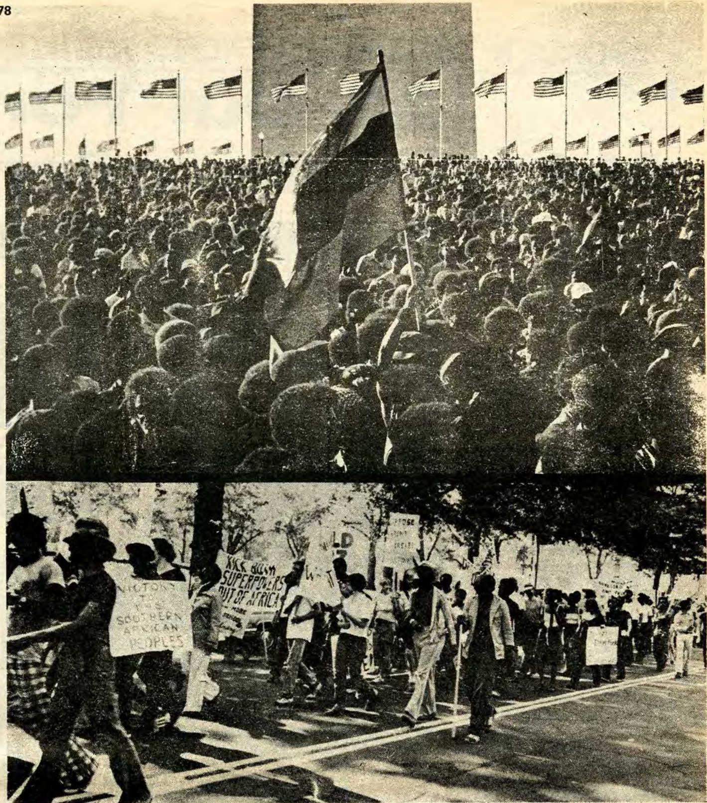
Following in the glorious tradition of African Liberation Days of past years, like these in 1972 and 1977, this year's event will include a broad range of forces. But the accumulation of new people to the Party, as well as to the African Liberation Support Committee will be the long-term significance past May 20th.

As the national center for southern Africa support work and the fight to free the Wilmington Ten, the NCSAL is the most viable coalition in which