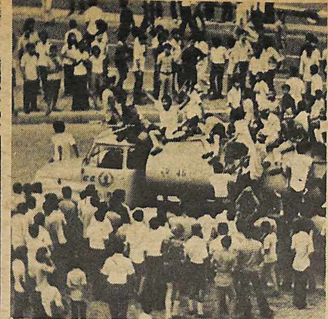
USA The people of all countries, though facing different conditions and steps in their struggle, have a common goal—overthrowing imperialism, ending the rule of all exploiting classes and building socialist society and advancing to communism.