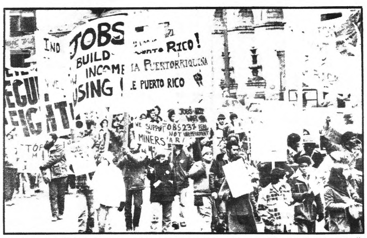
Call photo of the CP M-L "March for Jobs" on Washington D C in February Many people enthusiastically supported the march, but left in disgust after the "pep rally" held later. It became clear that the CP M-L has moved fruther into reformism and cannot provide leadership to the working class and its allies.