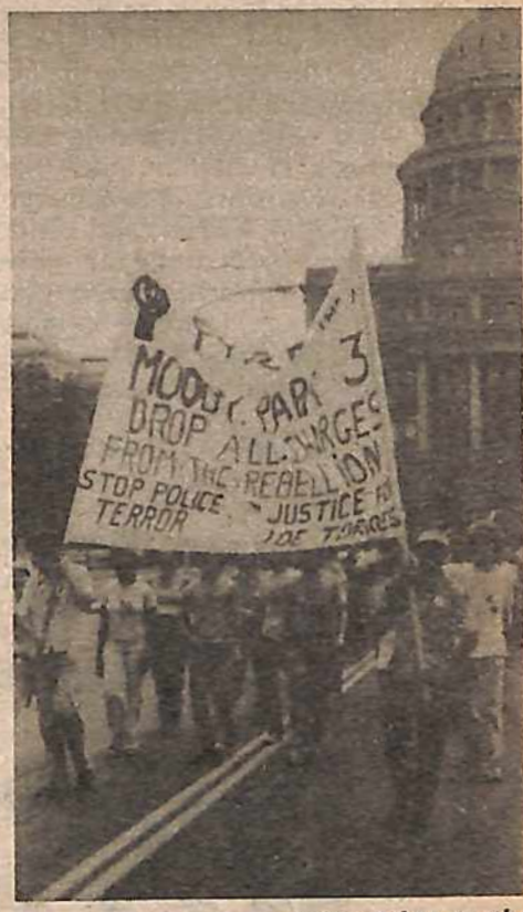
Austin RCYB Convention takes to the streets in support of the struggle in Houston.

All of this was in stark contrast to the methods of the Mensheviks who sought to leave the important questions to a few hotshot "experts," while trying to rob the initiative from rank and file Brigade members who they considered