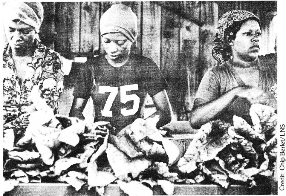
Women in North Carolina prepare tobacco for hanging.

We are clear, however, that fully socialized production and full equality can only be won with socialism. Ultimately, the liberation of women is integrally bound up with the struggle for socialism. It is imperative that the leading elements in the fight for the democratic rights of women consciously link their movement with the overall revolutionary struggle of the working class for socialism.