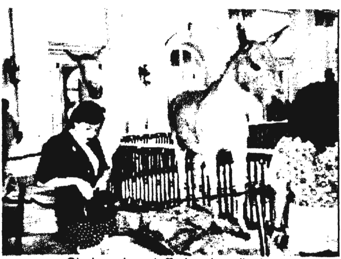
Che's mules, stuffed and on display

Yes, Che is everywhere -- on the billboards, on the buildings, on the currency, in the bookstores, and in many museums. The Che t-shirts, posters, paintings and post-cards seem geared toward the tourist trade. In fact, the Museum of the Revolution (the old Batista palace) is almost as much devoted to Che alone as it is to the total Revolution. Every scrap of his personal possessions -- bloodied, bullet-ridden clothing, utensils, guitar, radio, etc. -- has been preserved. Even the mules which carried his