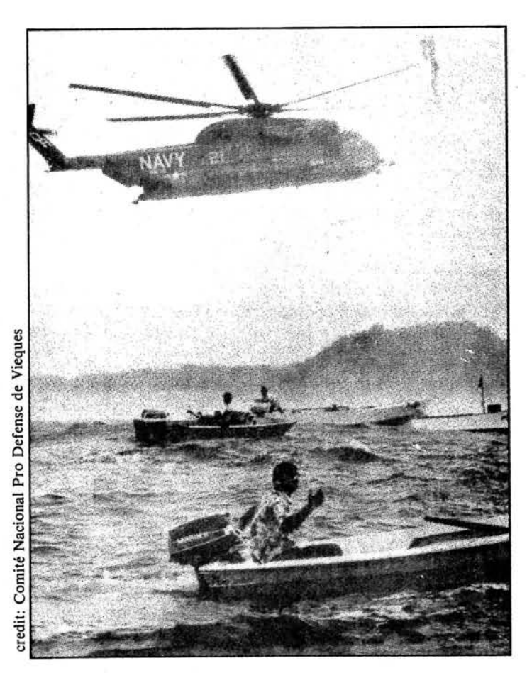
For the last two years Vieques fishermen have confronted US and NATO naval forces with their small fishing boats.

Following is a translation of a statement by the Puerto Rican Socialist League (LSP) published in El Nuevo Dia , San Juan, November 24, 1979, and signed by almost 100 organizations and more than 200 individuals: every major independence organization in Puerto Rico; all the Puerto Rican armed clandestine organizations in both Puerto Rico and the US; Puerto Rican and solidarity organizations in the United States; and all the Puerto Rican prisoners of war.