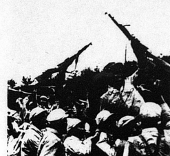
The friendship between China and Korea has been built up and developed through prolonged struggle. Having suffered their common enemies—American and Japanese imperialists. Photos show the self-organizing—over when the Chinese People's Volunteers and Korean People's Army were warmly conducting their common fight together.

After the weakening of the SEATO alliance and further rise of revolutionary activity, the U.S. imperialists sought new "alliances." On January 10, 1956, the U.S. puppet Marcos of the Philippines moaned about the necessity for "collective defense" of South East Asia and reached the necessity of a crusade against China and communism. He pushed forward a plan of "collective security system" under the U.S. financed