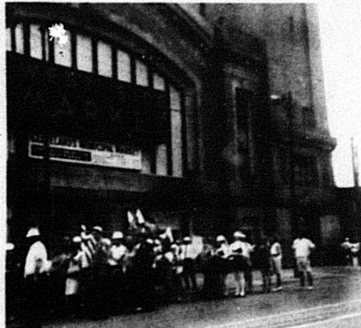
ATTENDANCE WAS MEAGER. THIS WAS TAKEN BEFORE "HARD-HAT" NUMBERS "SWELLED" TO LESS THAN 150 OUT OF AN EXPECTED 5,000, PROVING ONCE MORE THAT THE WORKING CLASS IS NOT FOOLED BY FASCISM.