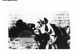
After three years of heroic and tireless struggle, Korean workers and Chinese People's Volunteers bravely defeated American invaders and stopped a gloomy victory of the anti-aggressive war. Photos show Korean People's Army counter-attacking heroically against the enemy to avenge atomic disaster.

During this period of twenty-five years, U.S. imperialism has lost all of its armed adventures and lies helplessly on the death-bed in Asia as well as all over the world. The Korean people and the Chinese people smashed the myth that U.S. imperialism is "invincible" during the Korean people's struggle against the U.S. imperialist invasion during 1950-53. While the revolutionary forces in both Korea and China have developed vigorously and are more actively engaged in the foreign aggressors and internal reactionaries, the U.S. imperialists are stricken with unresolvable problems at home and abroad. The successful development of the revolutionary struggles of the Indo-Chinese people has also punctured the arrogance of the U.S. imperialists. Armed revolutionary wars are raging all over Asia and the people of the whole continent are lightening the noose around the neck of the U.S. fascist aggressors. The celebrated thesis of Chairman Mao, that "IMPERIALISM AND ALL REACTIONARIES ARE PAPER TIGERS," has been vindicated by history. The successful development of people's war in Western Asia, the center of which is the Palestinian people's struggle against U.S. imperialists' stooges, the Israeli Zionists, has blown to the wind the nonsense that the Zionists cannot be defeated.