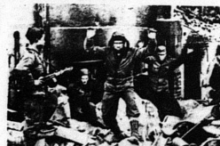
U.S. imperialism, which looks like a huge monster, is in reality a paper tiger. Photos show the war of the Korean People's Army against U.S. bandits.

"IN THE WORLD OF TODAY, WHO ACTUALLY FEARS WHO? IT IS NOT THE VIETNAMESE PEOPLE, THE LAOTIAN PEOPLE, THE CAMBODIAN PEOPLE, THE PALESTINIAN PEOPLE, THE ARAB PEOPLE OR THE PEOPLE OF OTHER COUNTRIES WHO FEAR U.S. IMPERIALISM. IT IS U.S. IMPERIALISM. IT FEARS THE PEOPLE OF THE WORLD. IT BECOMES PALE—STRICKEN AT THE NECK OF LEAVES IN THE WIND."