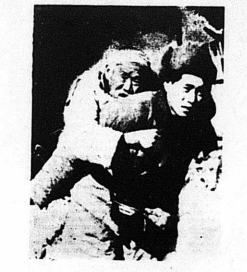
The blood-soaked great friendship and military unity between Chinese and Korean people can stand to any test and cannot be subjugated or broken.

of the Democratic Republic of Vietnam, on August 29, 1945. In China, under the glorious and correct leadership of the Communist Party of China, led by Chairman Mao, the People's Liberation Army defeated