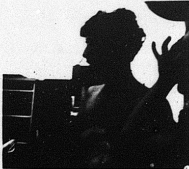
REVOLUTIONARY FIGHTER, BLOODY BUT UNBOWED, LOOKS AROUND FOR MORE FASCISTS TO ANNIHILATE.