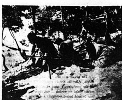
In their common struggle against the U.S. imperialists, the Chinese and Korean people have formed the blood-soaked great friendship. Photos show Chinese People's Volunteers fighting shoulder to shoulder with the Korean People's Army.

After the weakening of the SEATO alliance and further rise of revolutionary activity, the U.S. imperialists sought new "alliances." On January 10, 1956, the U.S. puppet Marcos of the Philippines moaned about the necessity for "collective defense" of South East Asia and reached the necessity of a crusade against China and communism. He pushed forward a plan of "collective security system" under the U.S. financed