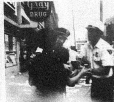
YOUNG WORKING-CLASS COMRADE VIGOROUSLY DENOUNCES THE FASCIST POLICE FOR THEIR CRIMES. THESE TWO FASCISTS COULDN'T HANDLE TWO REVOLUTIONARIES AND WERE FORCED TO CALL FOR REINFORCEMENTS.