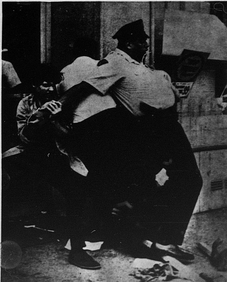
PHOTO SHOWS YOUNG COMMUNIST USING PROLETARIAN INGENUITY TO LIBERATE A COMRADE FROM THE CLUTCHES OF TWO PAPER TIGERS IN THE ANTI-"HARD-HAT" STRUGGLE IN CLEVELAND, JULY 26. THE REVOLUTIONARY PEOPLE, INSPIRED BY MAO TSETUNG THOUGHT, BITTERLY FOUGHT AGAINST A COWARDLY POLICE ATTACK AFTER MARCHING RIGHT THROUGH THE RANKS OF THE ONCE-FEARED "HARD-HATS."

Seeing that the revolutionary masses were not to be intimidated by their fascist brethren, the Cleveland police first tried to persuade the "hard-hats" to call off their "march", then carried out a cowardly attack on the revolutionary people. Once again the reactionary forces were exposed as paper tigers and the fascist police found the counter-revolutionary violence of their clubs and blackjacks answered by the revolutionary violence of picket sticks and bare hands. Our young comrades fought fiercely, joined by numbers of the broad masses, (Cont. on pg. 2)