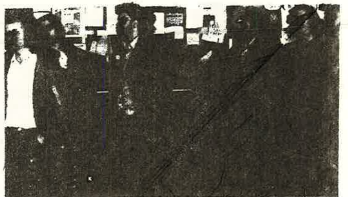
Students participating in the mass-democracy.

But this super-exploitation can only be carried out with an increase of police repression. Hence all this talk about 'law and order' and rising 'crime' rate. The unmistakable targets of a 'strong' police are the anti-fascist proletarian fighters, communists and sincere revolutionaries who are projected as criminals, and then violently attacked, thus attacking the anti-fascist proletarian revolution of the American people. Thus there has been violent repression carried out against people who took a clear anti-fascist stand, in particular we see that many progressive black youths have been murdered in cold blood, revolutionary communists who are engaged in building the Marxist-Leninist communist party are attacked; many be-