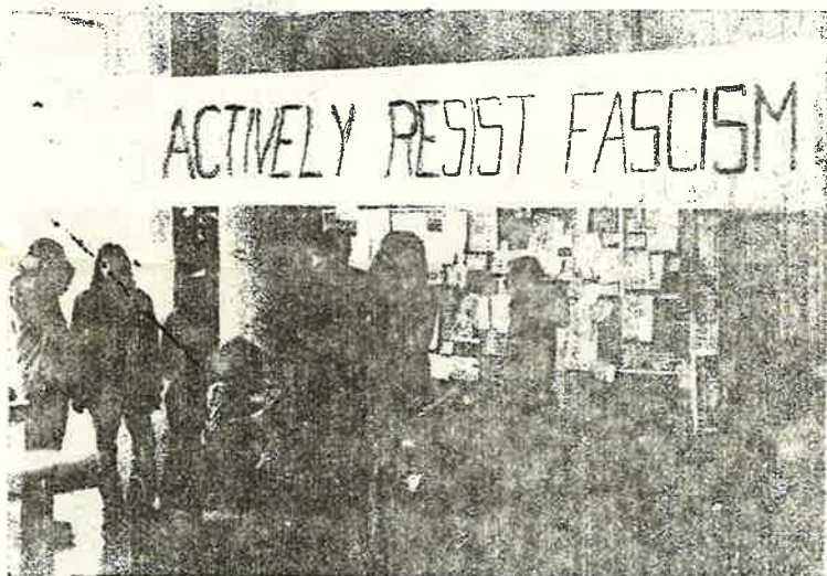
Students getting prepared for the mass-democracy 'Actively Resist Fascism'.

In the middle of February a mass-democracy under the title ACTIVELY RESIST FASCISM, was successfully held in the Fishbowl. The aims of the mass-democracy were: 1) to denounce the recent attacks of the fascist state machine and its agents on progressive and revolutionary individuals, organizations and movements; and to decide what to do about it. 2) in the spirit of active resistance to fascism, to organize to defend the fundamental democratic rights to freely discuss various ideas and to politically organize. The meeting was sponsored jointly by four organizations on campus: Ann Arbor Student Movement, New World Film Cooperative (cont'd next page)