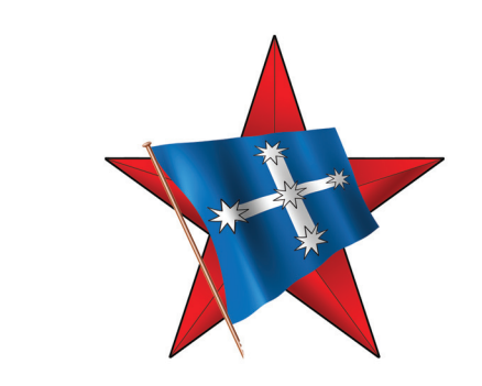
Communist Party of Australia (Marxist - Leninist) www.vanguard.net.au