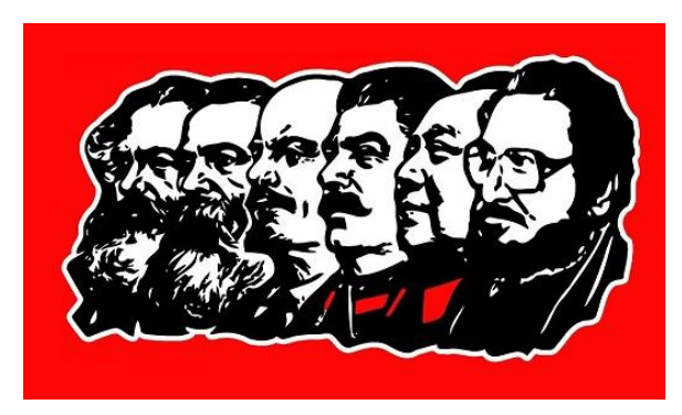
"Great Leaders" upheld by the Gonzaloists – reducing living revolutionary theory to dead figure heads?

However, the reification of the revolutionary theories of these and any other leaders misunderstands the ongoing dynamic, dialectical process of cognition and understanding. It risks and encourages congealing and blocking the constant dialectical process of practice, reflection and theorisation and the refinement of theory, then testing theory again in practice, further modification, and so on. (See Mao: On Practice).