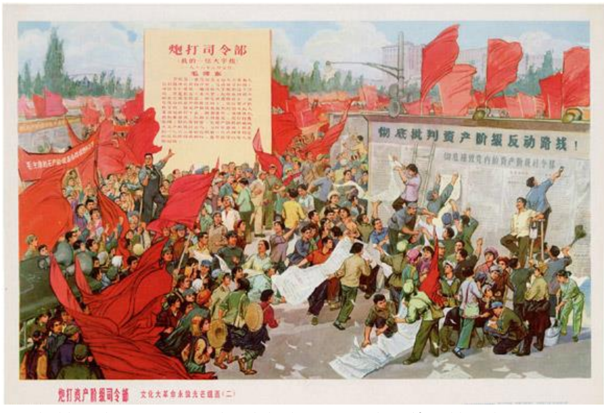
Bombard the Headquarters – an artistic take on the big character posters that proliferated during the Great Proletarian Cultural Revolution to push back the capitalist roaders and proponents of bourgeois right

Army and the People's Liberation Army that developed from it. In general, basic items of consumption such as food, clothing and medical attention were provided under the free supply system. The heightened revolutionary enthusiasm and ideological awareness sustained this method of distribution as an embryonic form of distribution based on the Communist principle of "from each according to ability, to each according to need".