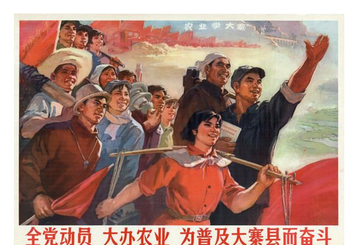
A poster of the Cultural Revolution; the slogan reads: "Mobilize the whole party, develop agriculture, and strive for the popularization of Dazhai County"

Firstly, the basic accounting unit of the People's Commune. From the situation in Xivang, it seems that it was perfectly right to implement small-team accounting for a period of time after the People's Commune was transformed. After a few years of development in production, the small-team accounting became unsuitable. In the last two years, many of the brigades that I have visited have done a good job of accounting for the brigades. I have discussed with many comrades at the sub-county level, and they agree that in order to make a great effort in agriculture and to reduce the differences between teams, it is imperative to implement team accounting. Secondly, the question of labour management in the people's communes. The method adopted in Dazhai is called "standard work points, self-reporting and public discussion". The implementation of this system of work evaluation has put politics in charge. At present, most places in the country still use the system of fixed-rate work and live