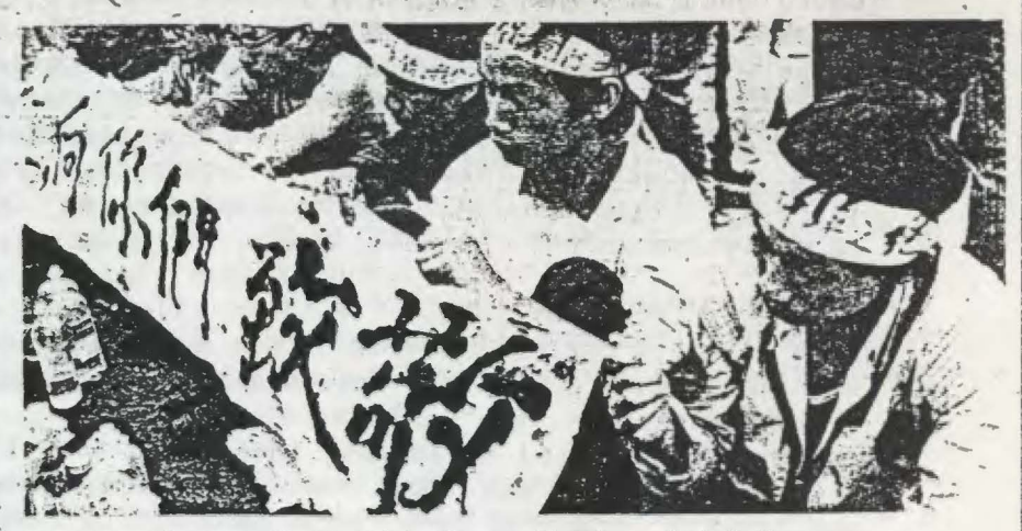
Protesters on hunger strike: Crisis, bloody turmoil and tragedy in Beijing

For quite some time now, in the pursuit of rapid modernization, big foreign and Chinese capitalists as well as petty entrepreneurs, merchants at all levels and rich peasants have been allowed to enjoy the right to own means of production and distribution, reap private profits, and exploit the work-