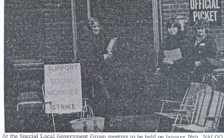
their existing grades. The important lessons learned from this struggle will serve them well when they next take up the fight.

At the Special Local Government Group meeting to be held on January 26th, NALGO will decide on whether or not the time has come for social workers to return to work for the time being in the knowledge that, by their action they have wrung improvements out of their employer on