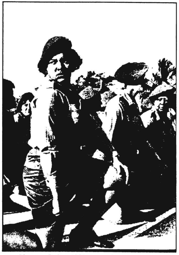
"Juramos", circa 1980, from a Cuban postcard

It is a platitude that the situation in Cuba is not a carbon copy of the USSR or of Eastern Europe, but I personally feel that there is much more serious work to be done besides relying on bourgeois appraisals of Cuba, before one can "advise" the Cuban masses how to be "revolutionary." One intriguing thing: when we asked people where the "well-to-do" lived, we got nothing but blank responses. Perhaps a place to start would be to do some investigation on the strata of Cuban bourgeoisie: