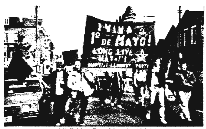
MLP May Day March, 1991

MLP members withstood arrests, imprisonment and political persecutions, and in addition to these heroic sacrifices, most MLP members made tremendous personal sacrifices every day for many years: forsaking careers of any kind, suffering material hardships in order to provide financial support for their party, and risking the alienation of family, friends and community. These were and are the constant sacrifices that all serious communist