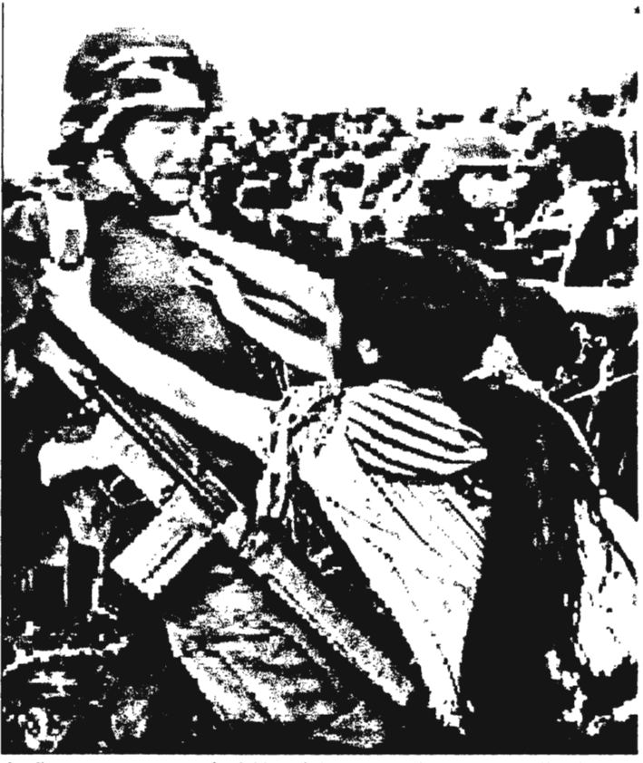
Indigenous women hold back troops trying to enter the town of X'Oyep in Chiapas on Jan. 3, 1998

Instead, the government has continued to carry out repression and a press campaign to weaken the political influence of the Zapatistas and other forces fighting in Chiapas. The government accused Bishop Samuel Ruiz and his human rights organization of being "frontmen" for the EZLN and of exaggerating the problems in Chiapas. Government press releases and interviews have painted