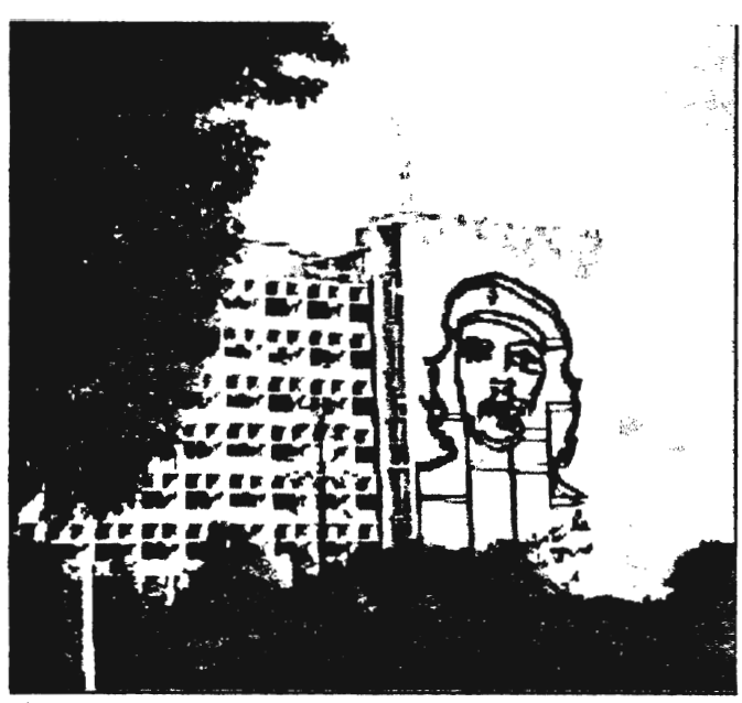
Che's image on the Ministry of Justice Building, Havana

overeducation of the people, and the fact that fuel shortage has arrested mechanization, Cuba is having trouble recruiting sugar cane workers. Supposedly, the government has been forced to double wages for cane-cutters. An interesting phenomenon is the considerable outmigration from the cities to the countryside of urbanites, including women, seeking employment on the private farms.