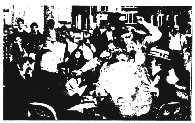
George Bush, American Capitalism and General Schwarzkopf in a May Day skit in Chicago, 1991

The MLP pushed the mass movements, pressured