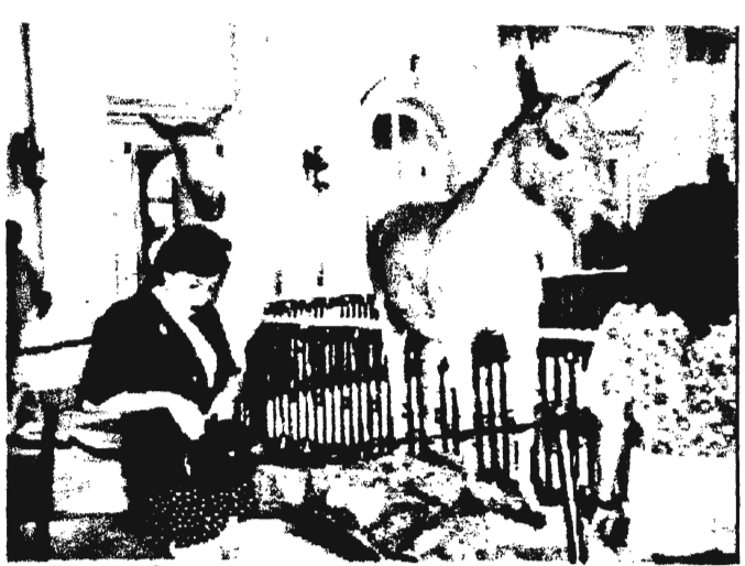
Che's mules, stuffed and on display

Yes, Che is everywhere -- on the billboards, on the buildings, on the currency, in the bookstores, and in many museums. The Che t-shirts, posters, paintings and post-cards seem geared toward the tourist trade. In fact, the Museum of the Revolution (the old Batista palace) is almost as much devoted to Che alone as it is to the total Revolution. Every scrap of his personal possessions -- bloodied, bullet-ridden clothing, utensils, guitar, radio, etc. -- has been preserved. Even the mules which carried his