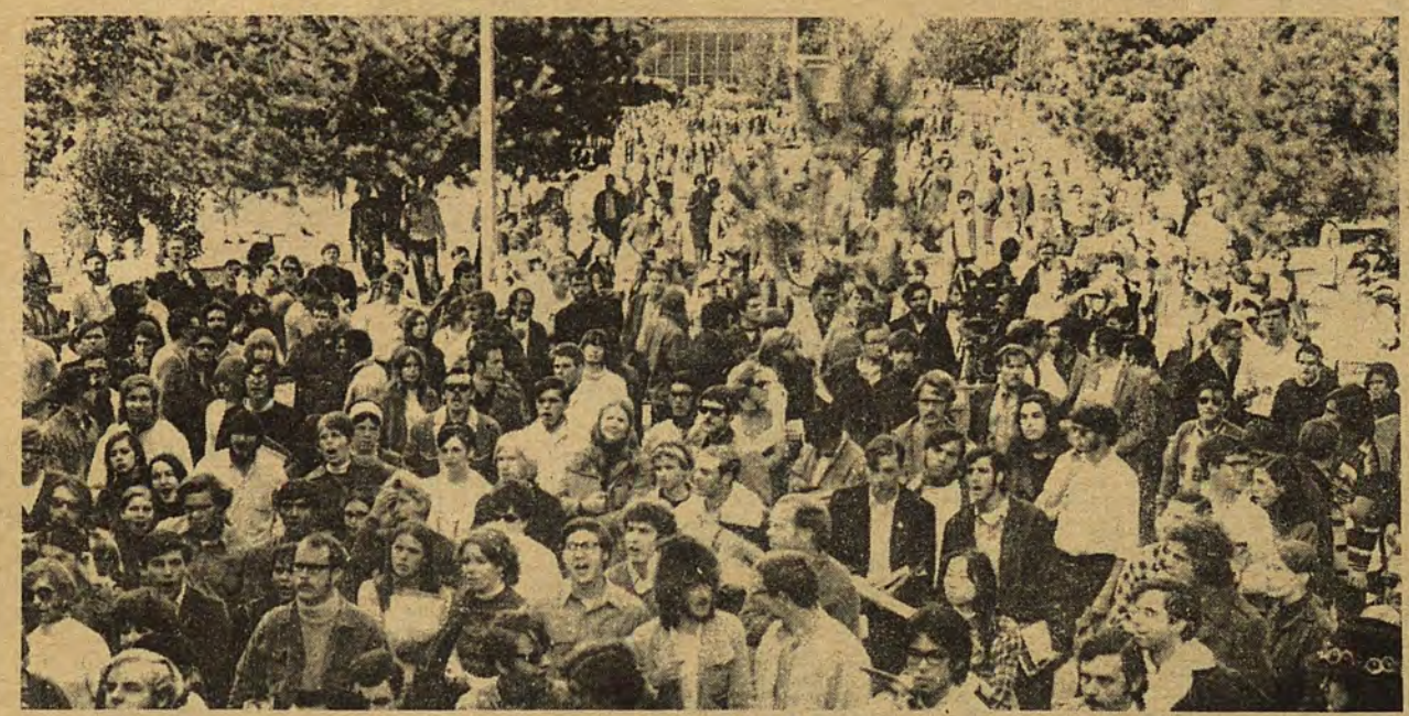
S.F. State Strike -- students march on Administration Building