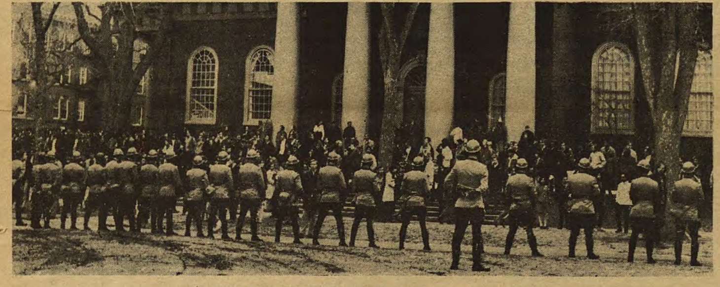
Liberal Harvard calls cops in attempt to save ROTC