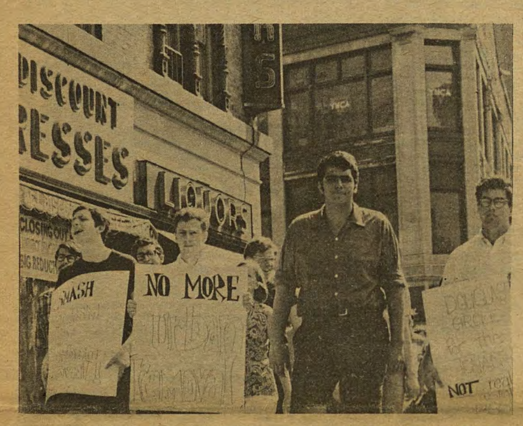
In New York (Sept. 13) SDSers march against Columbia expansion into Harlem (left). In Cambridge (Sept. 11) members of the Rent Control Referendum Campaign push their way into the Election Commission to demand their proposed law be put back on the ballot. In both these places (and in

inted by union labor - other labor donate FIRST CLASS