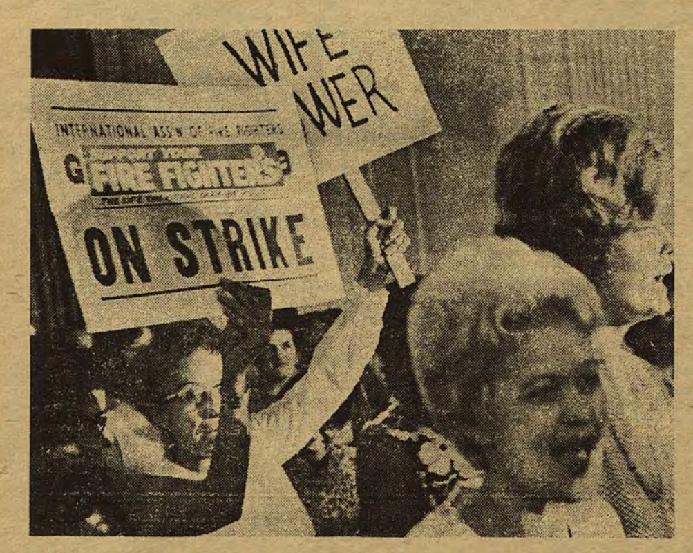
Clippings from Chicago Sun-Times show bosses' attempt to divide these militant women from their husbands

On Aug. 4, an estimated 40 firemen's wives set up a picket line around the central fire station in downtown Gary. They kept the station's trucks from rolling and made an engine from another station detour on its way to a fire.