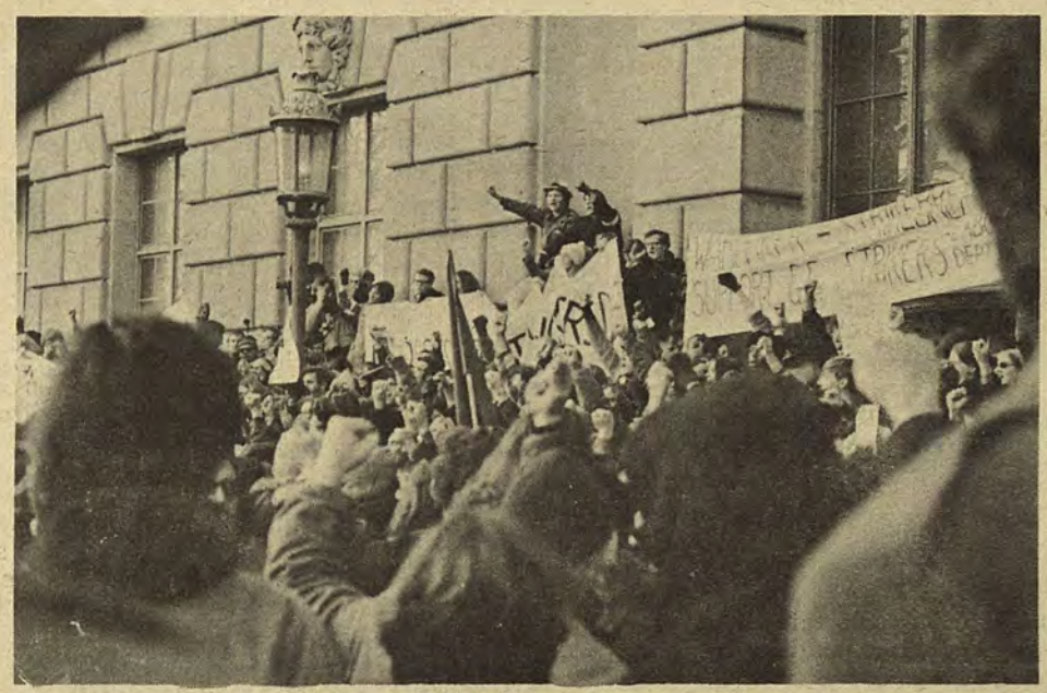
militancy grew ...