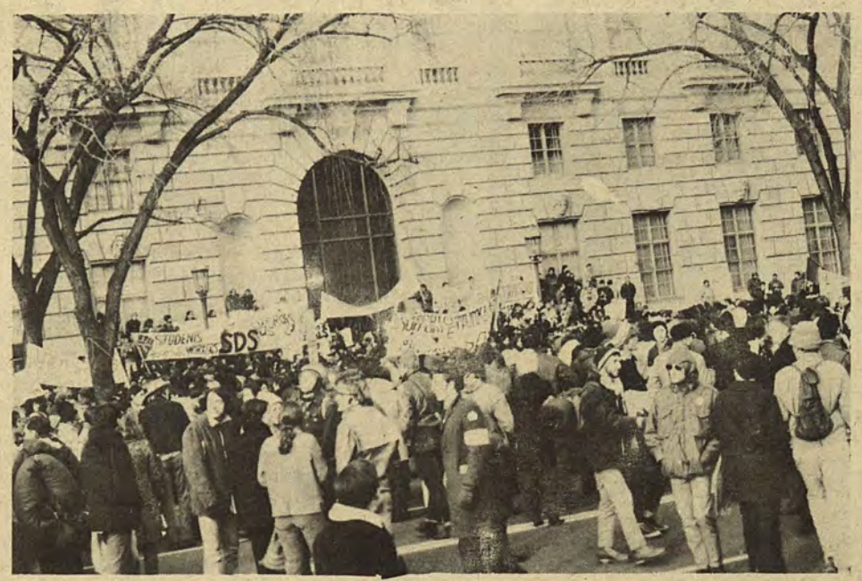
Crowd in front of Labor Dept. before demo...