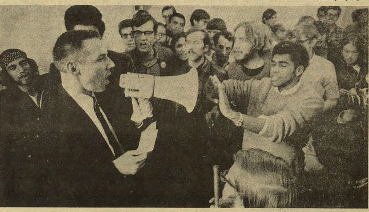
students demand end to racist pay differential

8. Demands must be small enough to be winnable and must be seen by most students as just. We must explain them in terms of connection of the university to the exploitation of workers all over the world, to the War, and racism. If the demands are won, students will realize that they have the strength to win and workers will view us more seriously. If we lose, we should expose the bosses' excuses. '