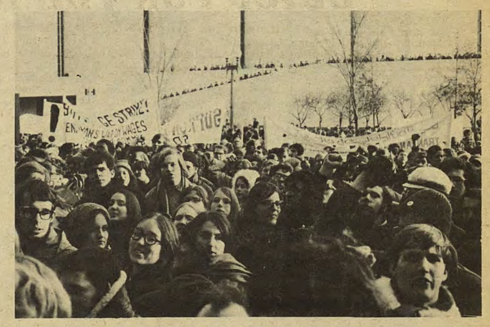
soon swelled to thousands ...

About 75 students seized the Boston University Administration building on December 8th demanding: that no GE recruiters be allowed on campus; that injunctions against students fighting GE recruiters be lifted; that all charges be dropped against those arrested in previous militant demonstrations against GE; and that the university sponsored conference on "business in the Ghetto" December 16th be cancelled. Students remained in the building overnight, and support increased steadily. By Tuesday afternoon, however, students voted to leave the building, since they couldn't build for smashing the racist conference if they were all occupying a building. The departure form their offices was only a small comfort to the deans since the campaign has repeatedly held meetings of over 1,000, and there is growing support for SDS's demands supporting GE workers.