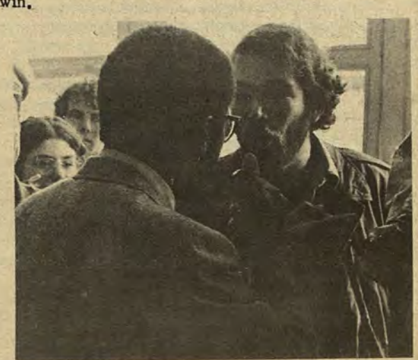
SDS supports campus workers

We still have a long way to go but we feel confident that the CWSA will be built by having faith in the people and daring to struggle and daring to