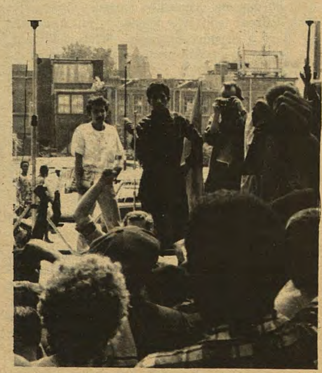
High school teachers and students march in Washington demanding an end to racist treatment in the schools.

The striking longshoremen who have tied up the West Coast docks for months present a great example of defiance of the Nixon wage freeze and strike ban. People from the demonstration joined the longshoremen on the picket lines in a show of support of their fight against the big business bosses after the demonstration.