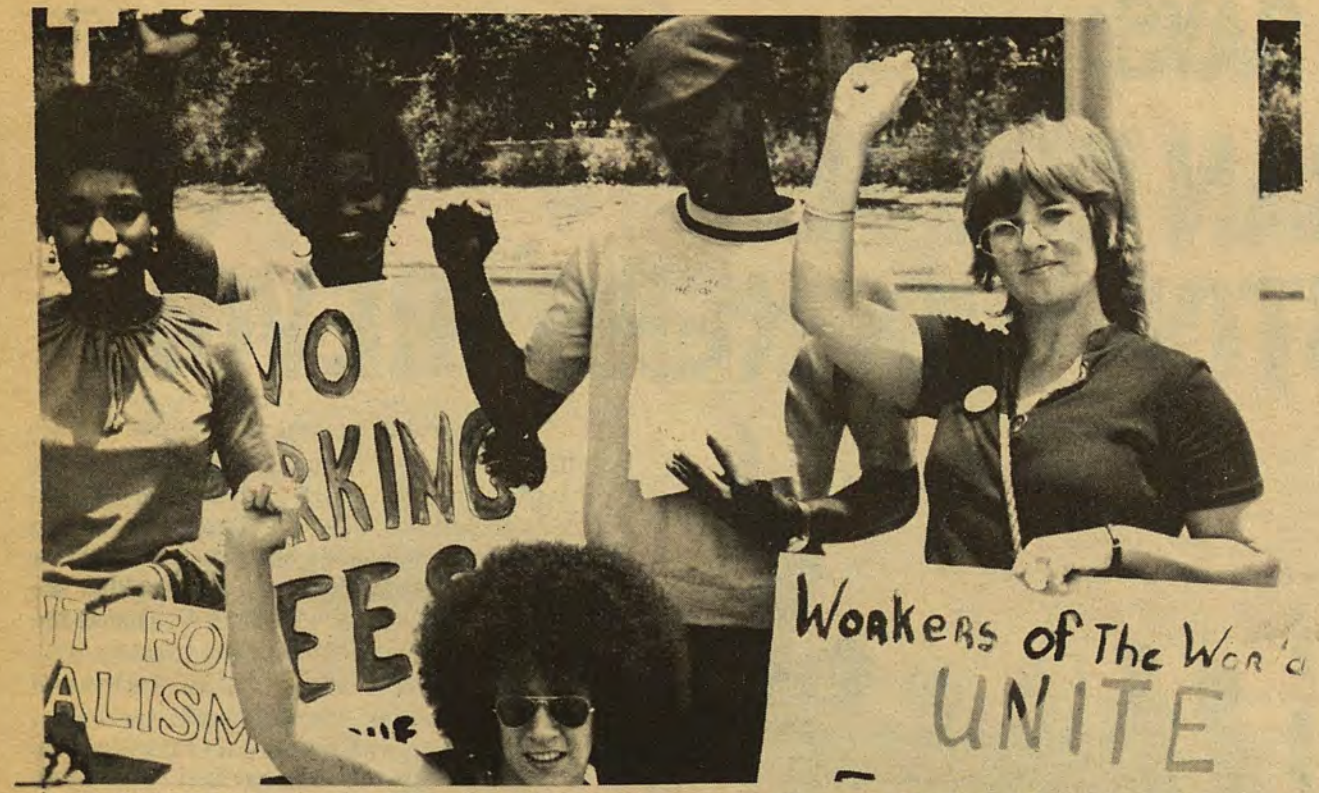
ine "Houston Poor People United to Fight" were joined by the Texas Southern University SDS in their picket line protesting against the .parking fees hike at the county "charity" hospital in Houston.