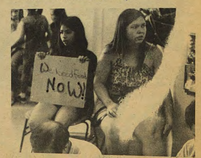
Students in welfare office to demand more food stamps.

The Welfare bosses, like all bosses, are scared of people who will stand up and fight. Experience has shown the bosses will retreat every time they find themselves faced with massive worker-student unity.