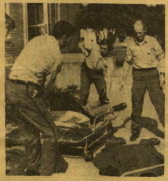
two victims on the campus of Southern University at Baton Rouge.

Police murdered two black students in Baton Rouge today, in the wake of a threeweek old rebellion which is sweeping across the campuses of Louisiana.