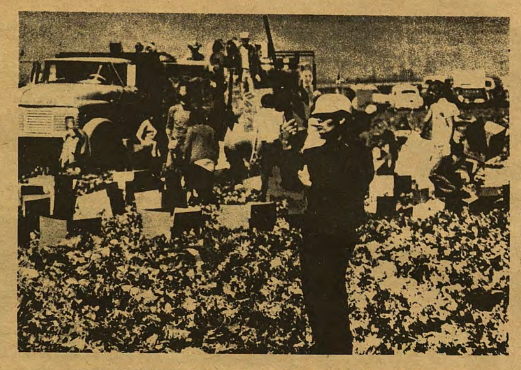
PRIVATE COPS GUARD SCABS IN WEST COAST LETTUCE FIELDS.

It is not a mistake that the growers treat the farmworkers with such inhumanity. It is not a mistake that most farmworkers are