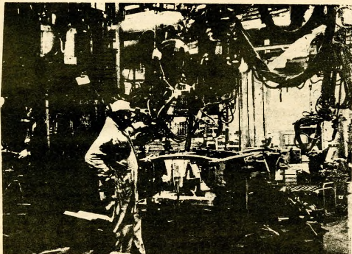
by Steve Wagner Industrial Claim #F-860525

There is a side to American industry that only victims see. The mass media never mentions it, but it's there. That side is full of death and destruction.