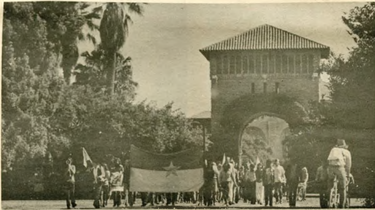
CROWD MARCHING TO LYMAN'S OFFICE IN CENTER QUAD