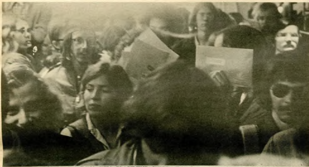
PEOPLE CROWDING INTO PLACEMENT CENTER TO STOP WAR RECRUITERS

In some ways, the 15 old white men on the Stanford Board of Trustees are very powerful. They control billions of dollars and they have many tac squads to protect that money. But in the long run, they are not very powerful at all. They are losing their power, while the people become more powerful with each day. All around them, people have risen up, are rising up, and will rise up to smash their power. The Board of Trustees has seen this happen in Stanford and in the surrounding community. They are learning a bitter lesson: you can dismiss a revolutionary, but you can't dismiss the revolution.