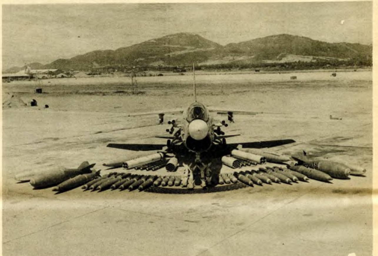
This surprise package is included in Nixon's 'peace' plan for withdrawal of troops.

But Nixon's next escalation will prove no more successful than past ones. The heroic peoples of Indochina will continue to drive the American aggressors into the sea.