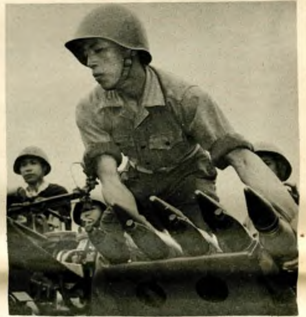
This Vietnamese brother and his comrades prepare to defend their homeland against Nixon's Vietnamization proposal. Keep a sharp aim, brother.

But, like we say, the Vietnamese are the kind to kick the tires before they buy. And with Nixon negotiations, the POWs may be sitting in Hanoi for a long time.