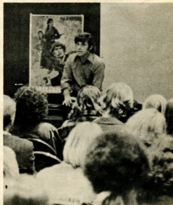
Franklin of Stanford

er to use its huge resources to serve the needs of all poor and working people.