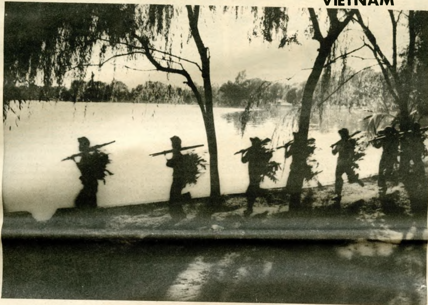
The Vietnamese people on the offensive against U.S. imperialism.

We Stand Shoulder to Shoulder with The Vietnamese.