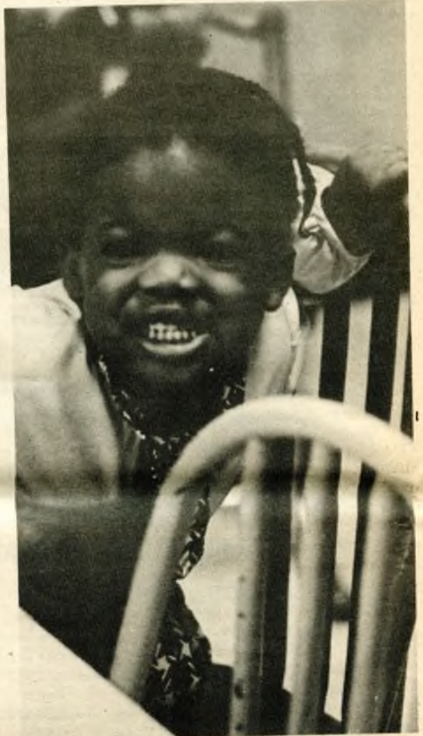
Power to the Little People

The Little Folks parents are not going to end their struggle until they have won the right to keep facilities they both need and want. They are taking legal steps as well as planning more public actions to show the city that they will not give up. Community support for Little Folks is growing and pressure is building for Menlo Park to serve the needs of these and all working parents.