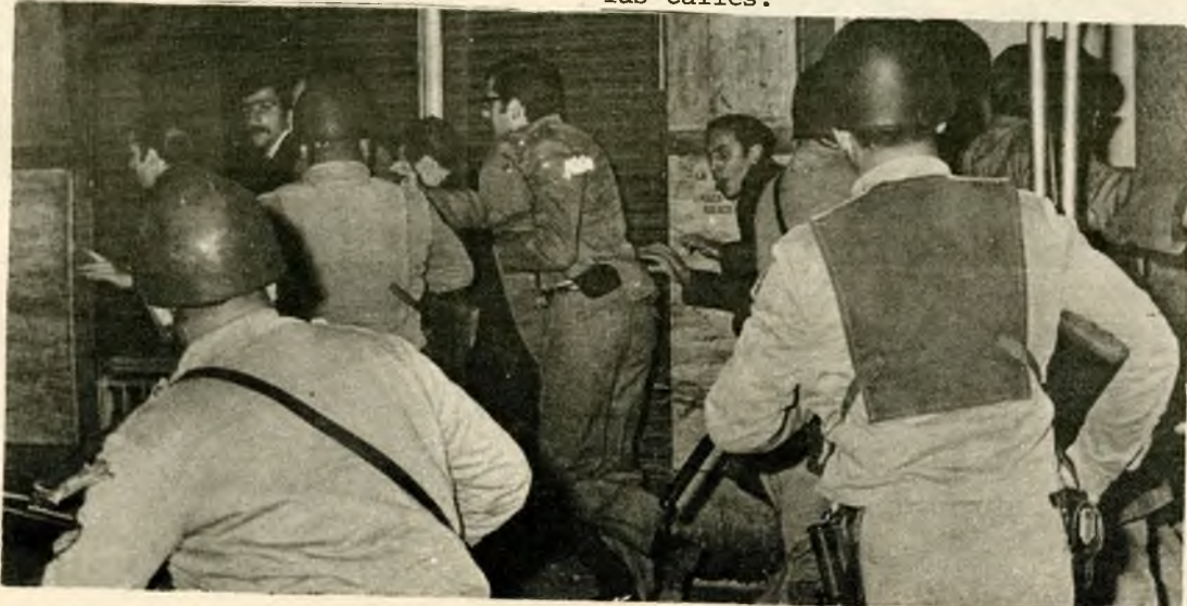
Soldados brutalizan estudiantes Argentinos

Mendoza, una ciudad de 250,000, pao por 24 ora con una huelga general. Mas de 2,200 tropas en caros armados y policias traídas de Buenos Aries patrullaron las calles.