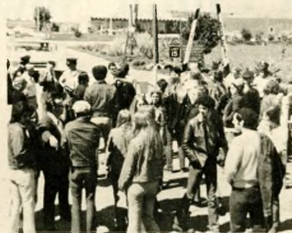
Demonstrators support the striking inmates at Elmwood, outside the gate.