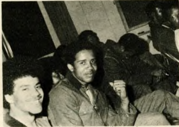
Brothers at Elmwood