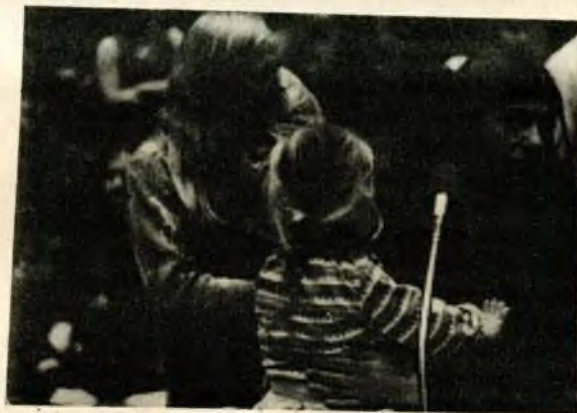
Mothers at the Council Meeting