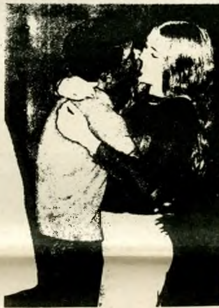
The result of forced busing

For over 50 years, the American public has been deluged with lies about negro "equality" and the need for an "integrated" society.