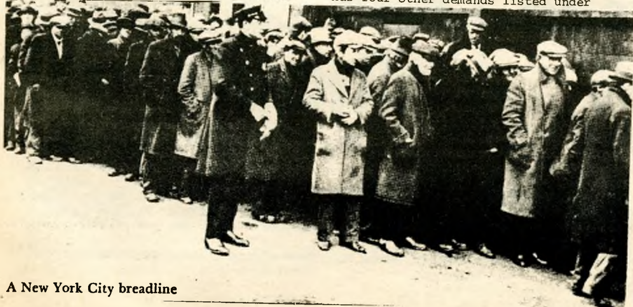
A New York City headline

To sum up, Venceremos strongly supports unionization and urges workers to vote for the Teamsters if they want to be organized to fight for immediate economic gains. But we know the workers need more, and that it takes a revolutionary organization to get it.