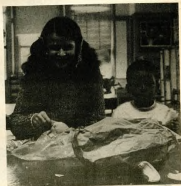
Lunch at the Sojourner Truth Center

Members of Venceremos, together with all our friends, struggle to meet the needs of the people. Venceremos members work in many "united front groups" such as Child Care Now, the Tenants Union,