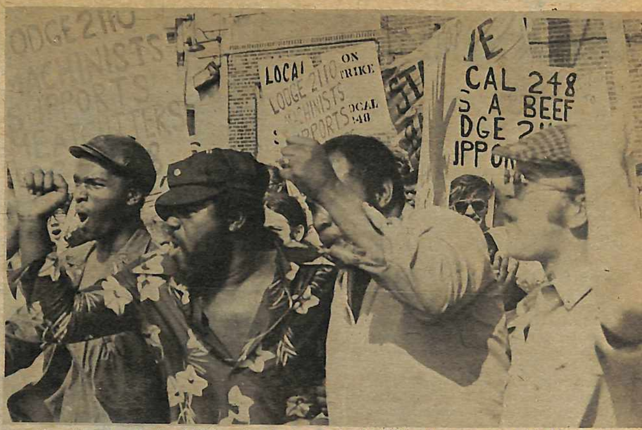
Greeting scabs at June 4 rally of 1000 workers in support of striking Milwaukee meatcutters. The 10-month long strike against union-busting and wage cuts has inspired and drawn together workers throughout Milwaukee area.

Before the strike began, help wanted ads for skilled and unskilled meatcutters appeared in papers. Continued on page 13