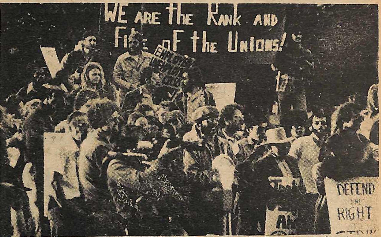
Demonstration of several hundred workers outside AFL-CIO convention on Oct. 3 raises demands of growing workers' movement.

Passing a law asking the capitalists not to chase the highest rate of profit is like passing a law asking the capitalists not to be capitalists. And Meany & Co. of course have no intention of saying or doing anything that challenges the capitalists' existence. Their aim is to direct workers away from real struggle against