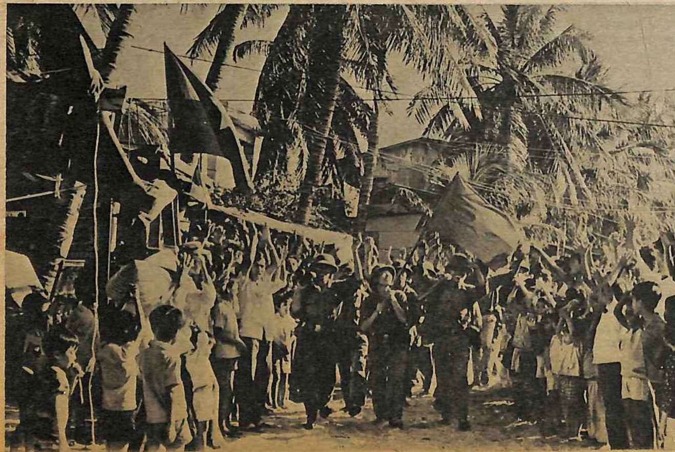
The long, revolutionary struggles of the Indochinese peoples have battered U.S. imperialism.