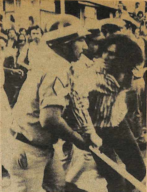
Demonstration of Sephardic (non-European) Jews against Israeli Zionist discrimination.

The ruling class is not particularly afraid of maniacal mystics like Fromme, bored middle class suburbanite informers like Moore, or romantic heiresses like Patty Hearst. It is the working class that the ruling class really fears and whose growing movement it tries to suppress. But it's the working class and the masses in their millions—armed with revolutionary understanding and revolutionary organization—who the ruling class can't stop.