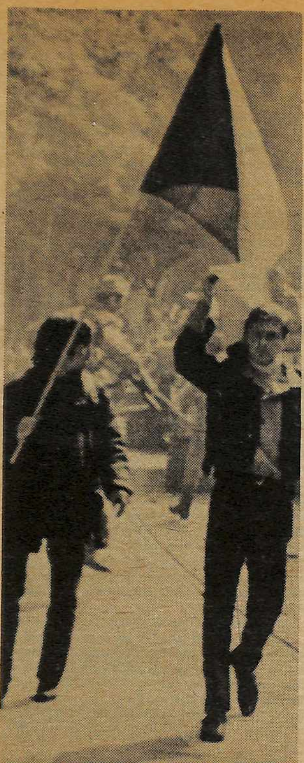
Invasion of Czechoslovakia in 1968 further exposed imperialist nature of Soviet Union. Above, Czech youths defy social-imperialists.