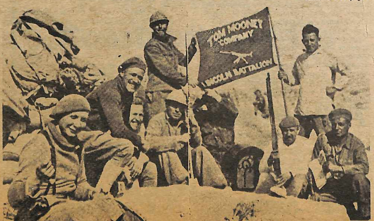
Workers from around the world fought together with Spanish workers and masses during civil war from 1936-'39. Above, U.S. contingent of the International Brigades.