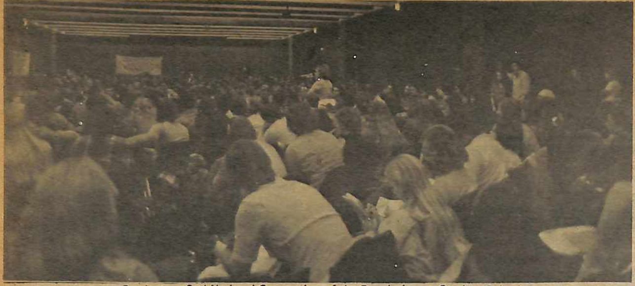
Students at 2nd National Convention of the Revolutionary Student Brigade.