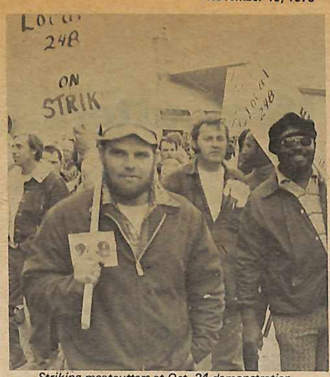
Striking meatcutters at Oct. 24 demonstration.

Carrying through this struggle in the union required preparation to keep the initiative in the hands of the rank and file. Party members and advanced workers put forward some proposals at a union meeting without having worked to win the rank and file to them, and as a result the hacks ducked the suggestions and seized the chance to attack the group. The