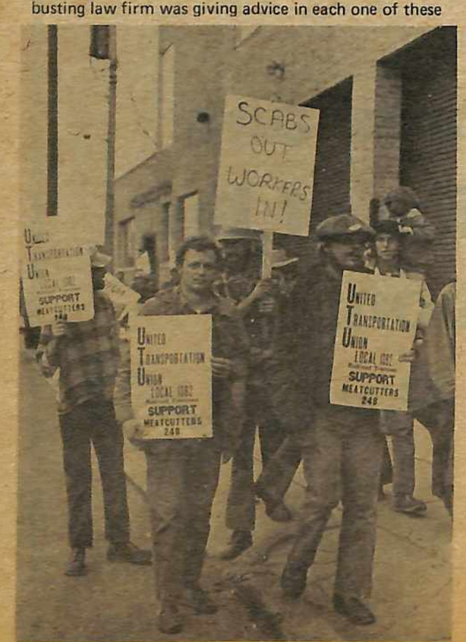
Workers from many Milwaukee industries came out on Oct. 24 to support meatcutters.

Workers at places like Harley-Davidson, Masterlock, and Stroh Die Casting had recently come off long strikes where scabs and cops were used in large numbers. The links between these workers and the meatcutters' strike were easy to see, especially since the same union-