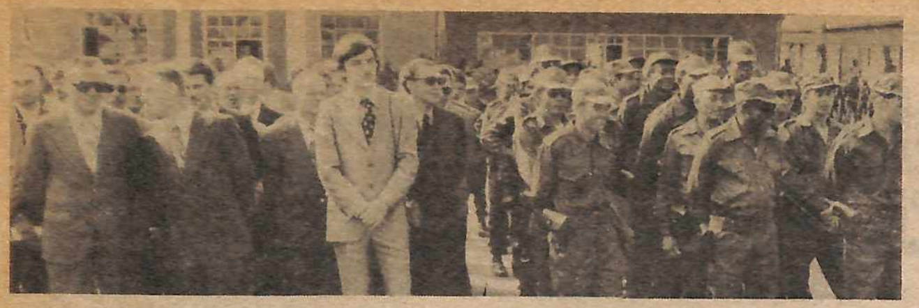
Social-imperialist division of labor: Russian "advisors" in their business suits and Cuban soldiers in their fatigues, at a ceremony in Addis Ababa, Ethiopia.