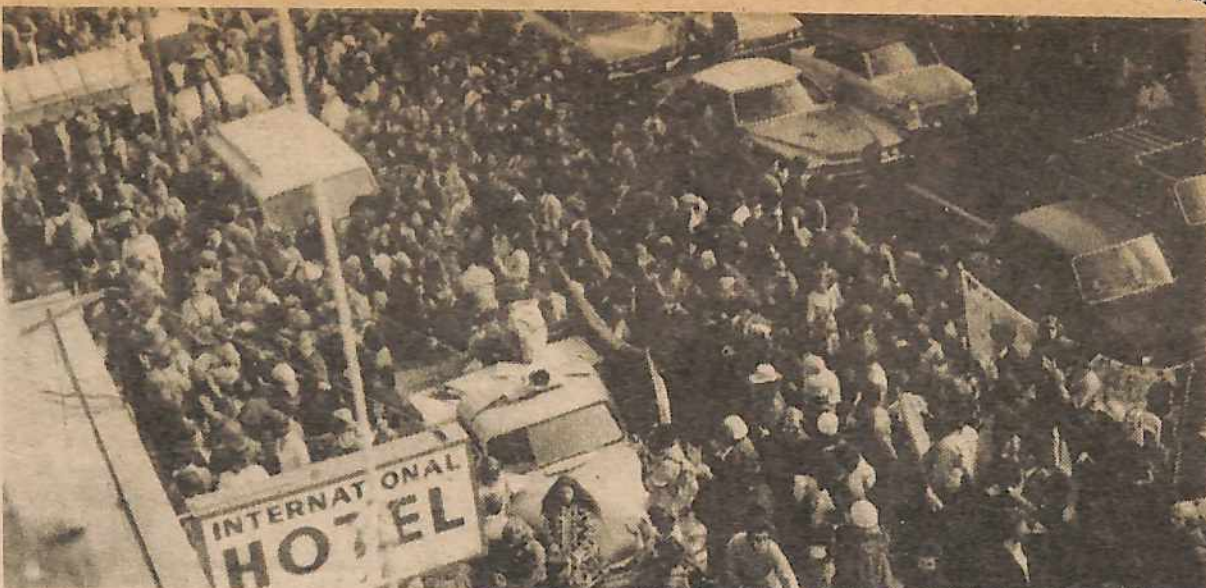
Thousands of people blocked the cops as they moved in massive force to evict the I-Hotel Tenants.

Broad political exposure of this was a key part of the I-Hotel struggle. Doing this required struggle with the line of various opportunists, but also struggle among among Party members, as well as with other activists,