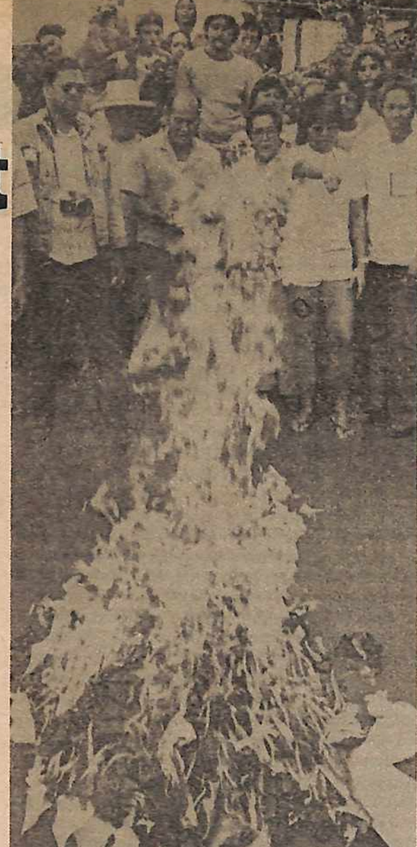
Residents of Waiahole-Waikane Valley burn eviction notices during struggle to keep their land and homes.

At the Kauai meeting it was clear that CP(ML) had chosen the line of the Ota Camp Struggle to defend because it is the same backwards line that they hope to