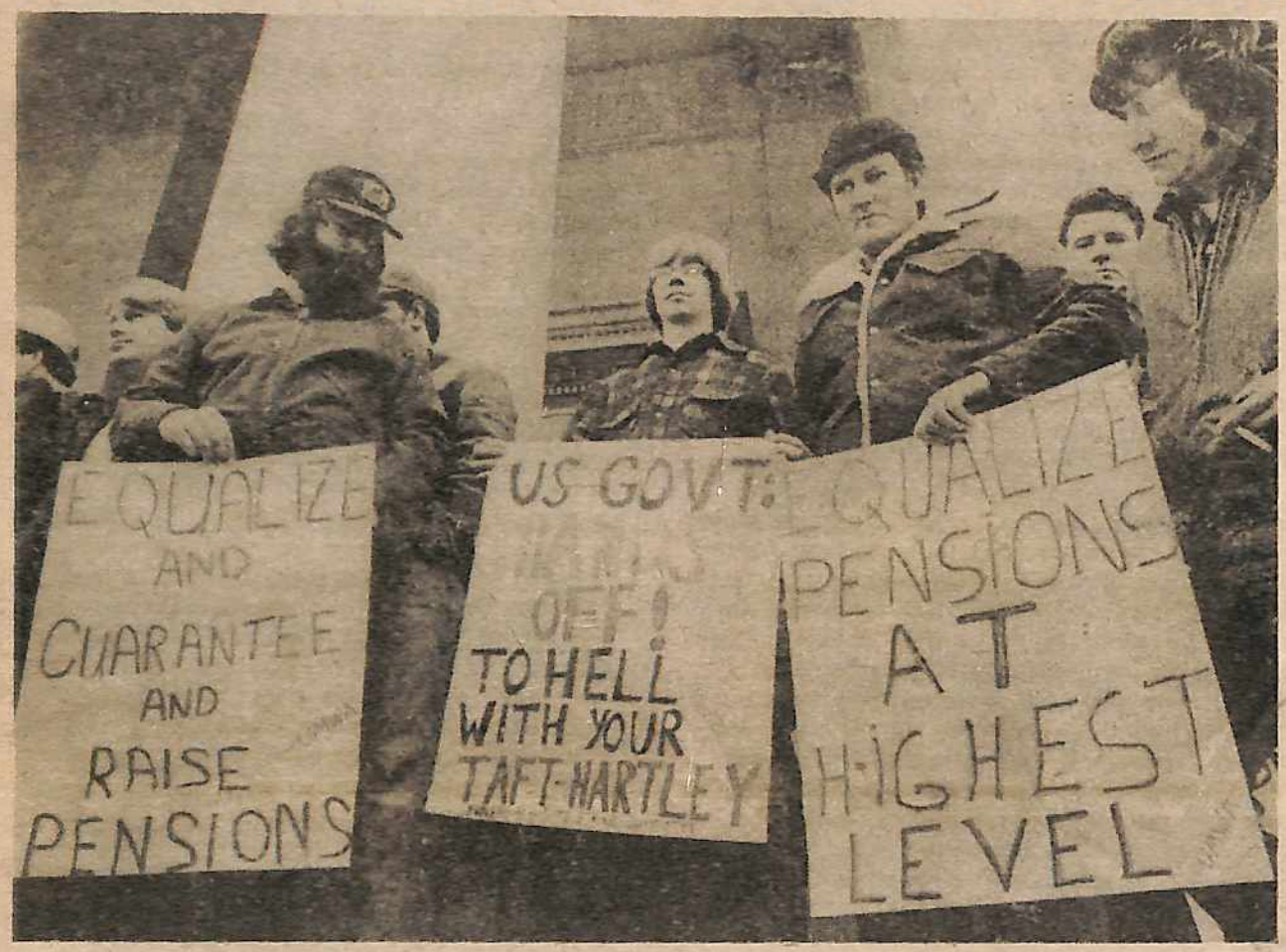
Charleston, West Virginia, February 18, 1978. Miners Right to Strike Committee and other miners demonstrate on steps of the Capitol building to denounce Miller's contract sellout, state their demands and make it clear that they will not work under a Taft-Hartley injunction.