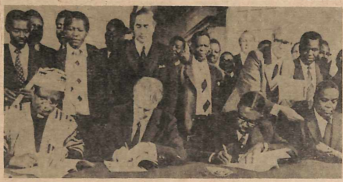
Ian Smith and his Black collaborators Muzorewa, Chirau and Sithole scribble their names to Smith's "internal agreement" for so-called majority rule. Very appropriately, they were sitting under a picture of Cecil Rhodes.