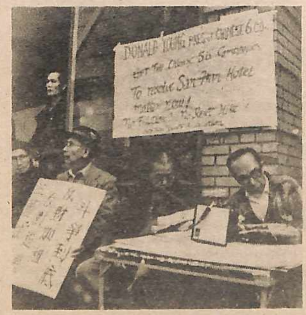
Sparked by the I-Hotel struggle, San Fran Hotel tenants take their battle against rent hikes to the masses of people. After a year of struggle the landlord, the president of the reactionary Chinese Six Companies, was forced to back down.

Party members, both through the mass organizations like the Workers Committee and independently, fought against this stagist view and tried to take out the line of exposing the politicians as broadly as possible. When the opportunists argued that people should give San Francisco Mayor Moscone and his so-called plan to "save" the I-Hotel a chance, the Workers Committee raised the slogan, "The Mayor's plan is an eviction plan," which it was. Boldly taking out this line on the politicians definitely helped to expose the nature of