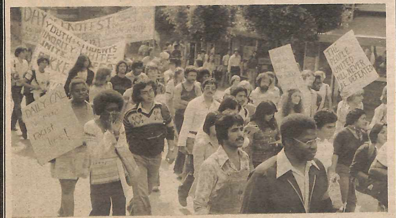
A U.S. Supreme Court decision on the Bakke case is expected in the month of April. The Bakke Decision is one of the sharpest attacks on minorities in years, aimed at ripping away important gains made in the mass struggles of the past decades, like affirmative action programs. In response the Revolutionary Communist Youth Brigade is mobilizing on college campuses and in neighborhoods all around the country for an Armband Day, April 12. The slogans the RCYB is raising are: Smash the Bakke decision! and Fight All Attacks on Oppressed Nationalities! Other actions and educationals are also being planned throughout the country by various other groups.