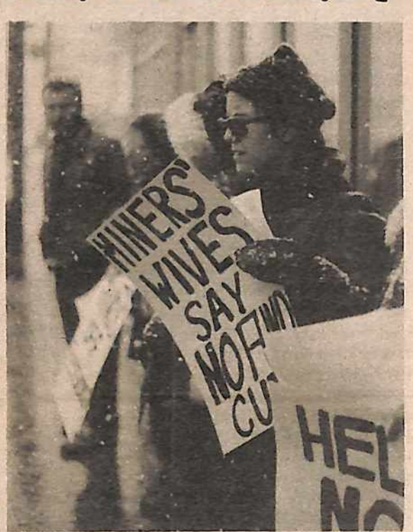
Women must be brought forward in all struggles.

Just as it is criminal for the conscious forces of the working class to abandon the woman question to the bourgeois reformists, so too must the related error of mimicking the bourgeois reformists, taking the question up only in the most narrow way—of just appealing to women around "women's issues" and failing to mobilize the masses of women in the struggle against every form of oppression—also be avoided. The road to women's liberation lies through proletarian revolution—this is the uncompromising stand of the working class. It is with this understanding that the Party and the class conscious workers must arm the oppressed masses of working women and the whole working class.