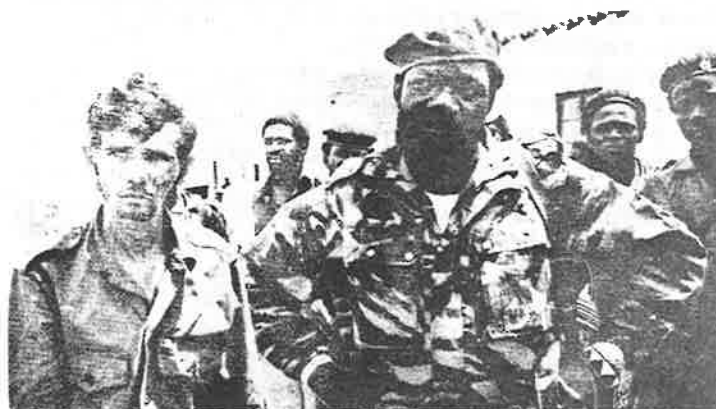
Dr. Jonas Savimbi of UNITA with a captured Cuban soldier. Just as U.S. imperialism used South Korean and Taiwanese puppet troops in Viet Nam, so the Soviet social-imperialists have sent over 11,000 Cuban puppet troops to massacre the Angolan people.