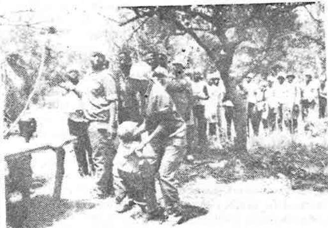
ZANLA Comrades preparing to vaccinate people against cholera (a disease brought to the war zone deliberately by rhodesian troops who polluted water wells).