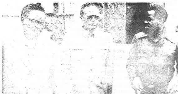
The leaders of the three Angolan liberation organizations. (l. to r.): Augustinho Neto, MPLA; Holden Roberto, FNLA; Jonas Savimbi, UNITA. The victorious centuries-long struggle of the Angolan people against Portuguese colonialism teaches the necessity of unity. But the Soviet social-imperialists have provoked a bloody civil war in an attempt to turn Angola into a Soviet base in Africa.

The revisionists turned the socialist state ownership into state monopoly capitalist ownership. In the name of the "new economic system", the capitalist principle of profits governs the economic activities of all enterprises. Enterprise managers are entitled to "hold, use, and dispose of the establishment's properties"; they have the right to "lease, transfer and sell the idle means of production"; and they are allowed to "recruit and dismiss workers" on their own authority and fire workers from their plants as they see fit. The relationship between the bureaucrat capitalists and the workers is entirely one of exploiters and exploited, the rulers and the ruled. An average workers' pay is only 60 or 70 rubles a month, while the salary for a bureaucrat capitalist can go as high as several thousand rubles (not counting the graft and corruption). In essence, the only real difference between the economies of the U.S. and the U.S.S.R.