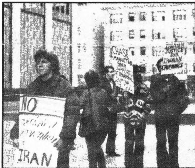
Demonstrators demand no intervention in Iran and extradition of the Shah at San Francisco picket line.

CPUSA/ML Leads Demonstration at San Francisco Federal Building