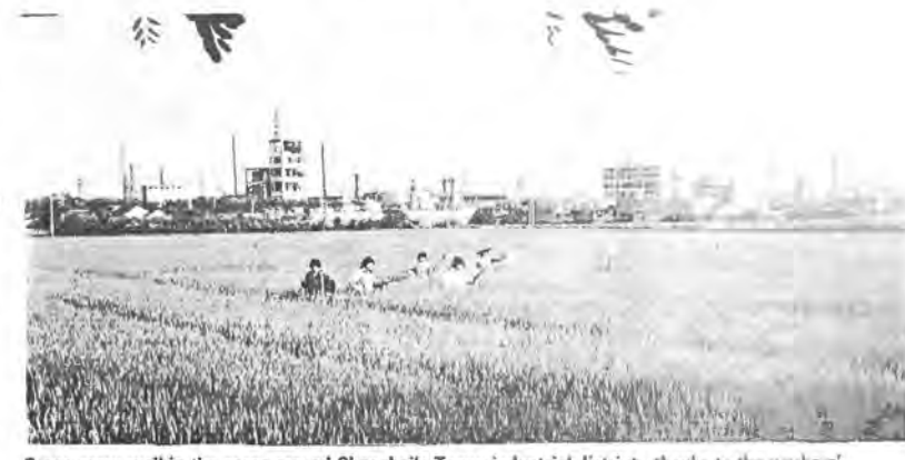
Crops grow well in the areas around Shanghai's Taopu industrial district, thanks to the workers' efforts in making multi-purpose use of industrial waste to prevent pollution

Everywhere today it is the same. Revolution is the main irend. And all the while the rivalry between the United States and the Soviet Union continued unabated. Despite the 'mutual recognition' of each other's 'scourity interests' based on the 'principle of equality', nothing has really changed. Their mutual interest consists only in the