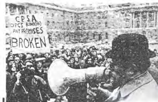
Civil servants outside Somerset House demonstrate in one of many actions against the freeze

Such solicitude for the consumers sounds odd coming from a government which has pushed food orices up by 22 per cent and plans further increases to celebrate entering the Common Market, But if any capitalists are caught by the new legislation they will be the smallest ones; and the system as a whole does not need their petty swindles to exist, and can afford 'consumerism' as an inexpensive diversion from the class struggle. The basic exploitation in this society is not exploitation of consumers, for we are all consumers, as surely as we are all born with a mouth and a stom-ach. The exploitation is class exploitation, hased on men's relations in production, not con sumption, and will not be ended by tinkering but by revolution