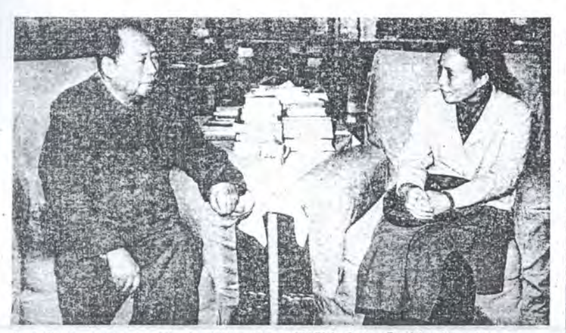
South Viet Nam's Minister of Foreign Affairs, Nguyen Thi Binh of the Provisional Revolutionary Government of South Viet Nam meets Chairman Mao Tsetung, in Peking on Dec. 29, 1972 (Page 4)