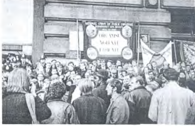
ctober 6th, A thousand council workers demonstrate outside County Hall, London, ounty Hall canteen staff and messengers stopped work from that day throwing the GLC into chaos.