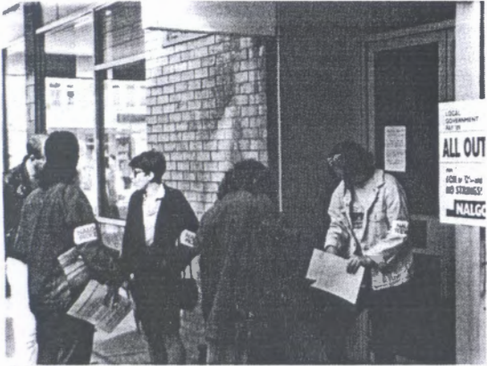
NALGO members picket for more pay.