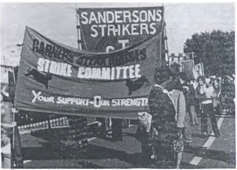
Demonstration by the catering workers of Garners' Steak Houses who are on strike for union recognition.