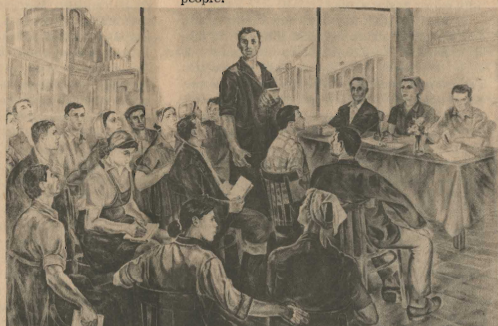
"SOCIALISM IS BUILT BY THE MASSES. THE PARTY MAKES THEM CONSCIOUS"

But this has not stopped the imperialist propagandists from declaring that "socialism is impossible", or that "socialism is no different than capitalism" - that in any event socialism is either a utopia or something that is not worth fighting for anyway. And the greatest service to this counter-revolutionary propaganda is performed by the pseudo "socialism" of the various revisionist states that have in fact betrayed socialism. The favorite trick of the bourgeois media is to point to the Soviet revisionists who live like new tsars and call this "socialism". In reality, however, the Khrushchovite revisionists are the big-