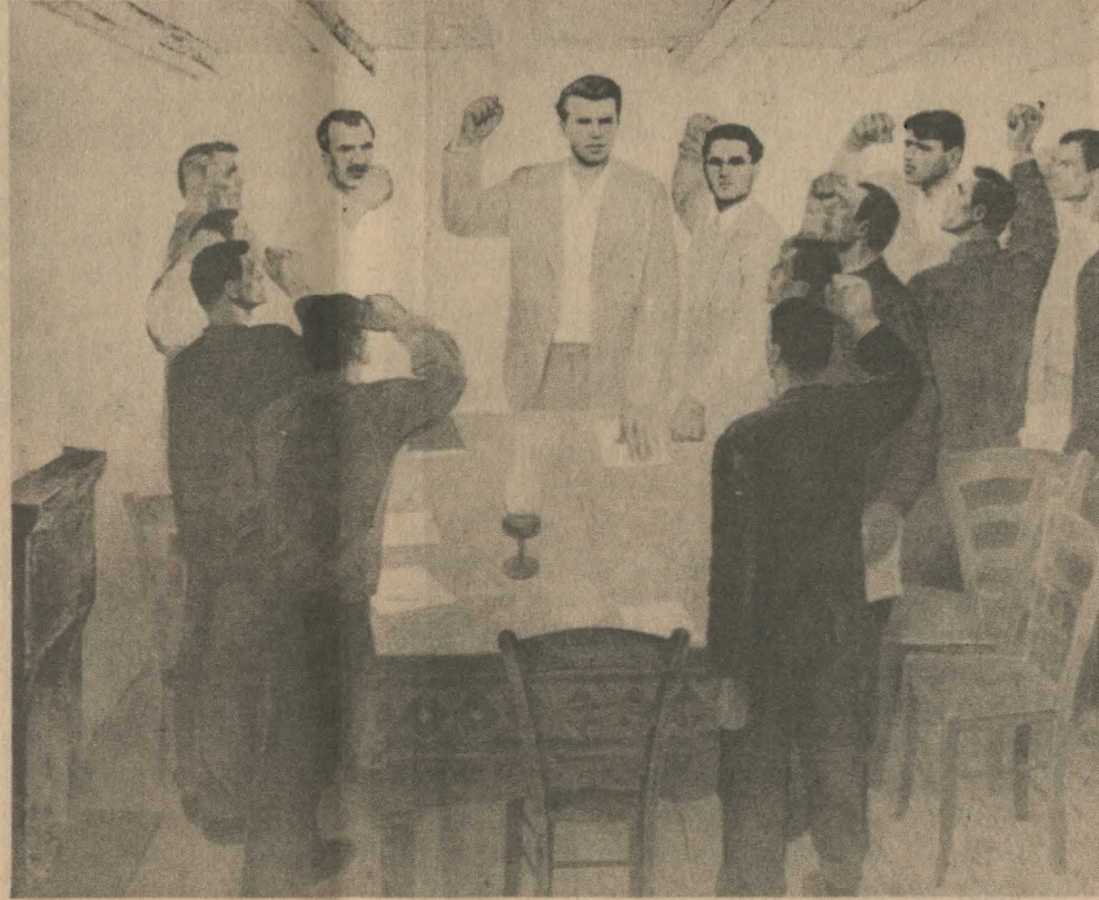
"The Founding of the Party"

Just as the PLA led the Albanian masses to liberation and today leads them in building a new life free from exploiters and without relying on any imperialist superpower, so too only the leadership of the Marxist-Leninist Party can open the path forward for the socialist revolution in the U.S. That is why the study of the experience and history of the PLA is a question of such burning importance for the class conscious workers and revolutionary activists. The COCSMIL hails the PLA on the occasion of its 38th anniversary of its founding and sends its ardent revolutionary greetings. □