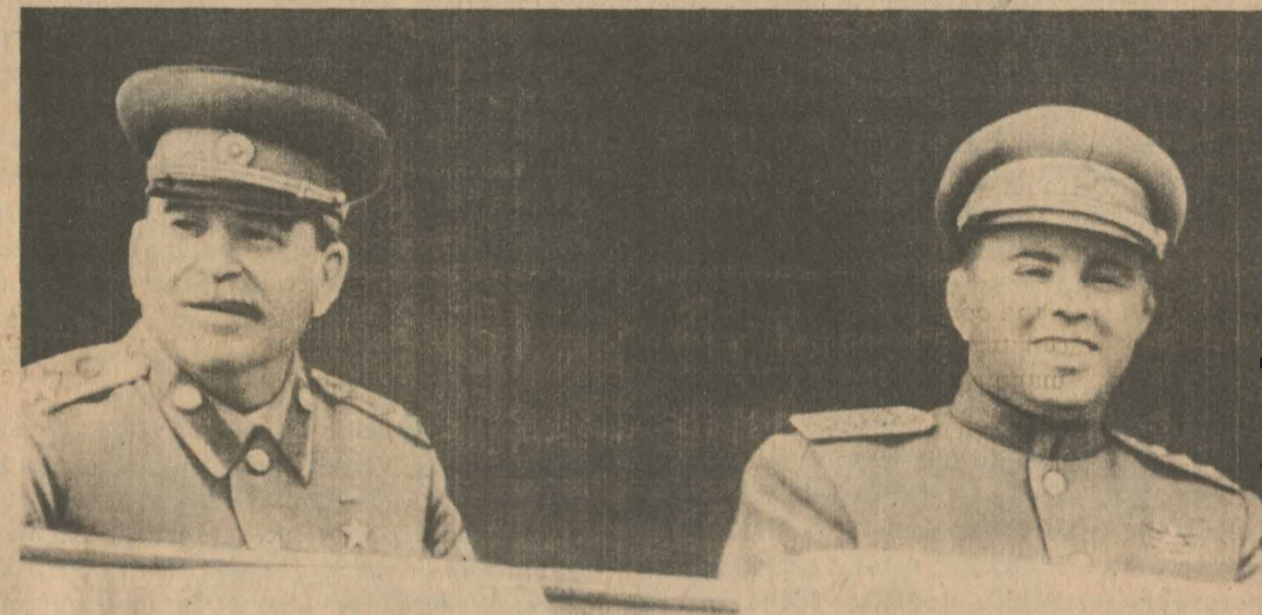
J.V. Stalin and Enver Hoxha