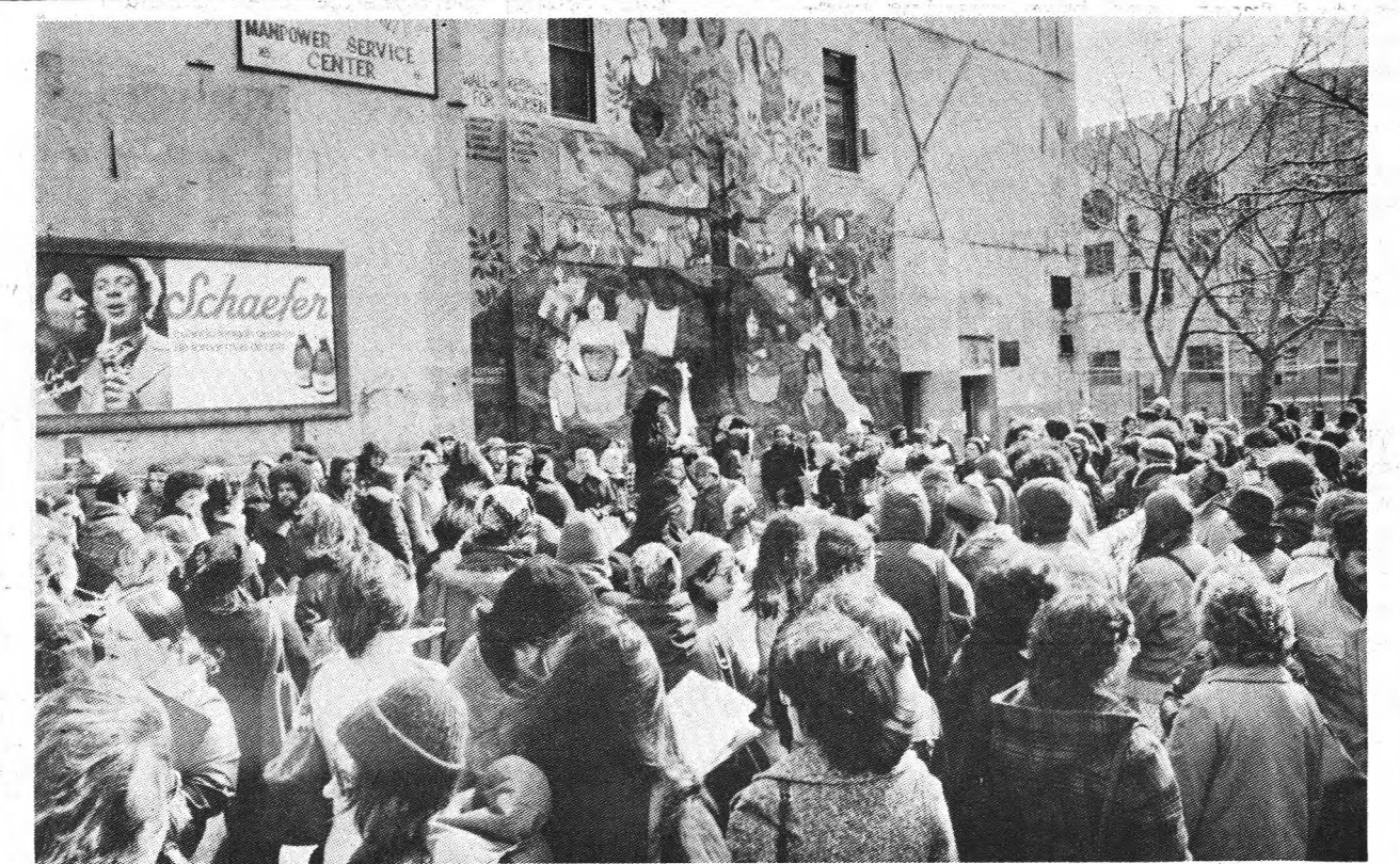
THE LOWER EAST SIDE CONTINGENT OF THE UNION SQUARE IWD RALLY IN N.Y., 1975. SPEAKERS FROM ORGANIZATIONS IN THIS CONTINGENT EXPOSED SOVIET SOCIAL-IMPERIALISM AND THE "C"PUSA, WORKING WITH THE MISLEADERS TO HANG THEM.

been going through in the past year. In the course of this flip, they've uncovered a whole series of right opportunist dangers in the movement that they hadn't noticed before. Just like the RU's proclamation of party building in the "brief period ahead", the OL has come up with a whole series of new justifications and sophistries to cover their latest maneuvers.