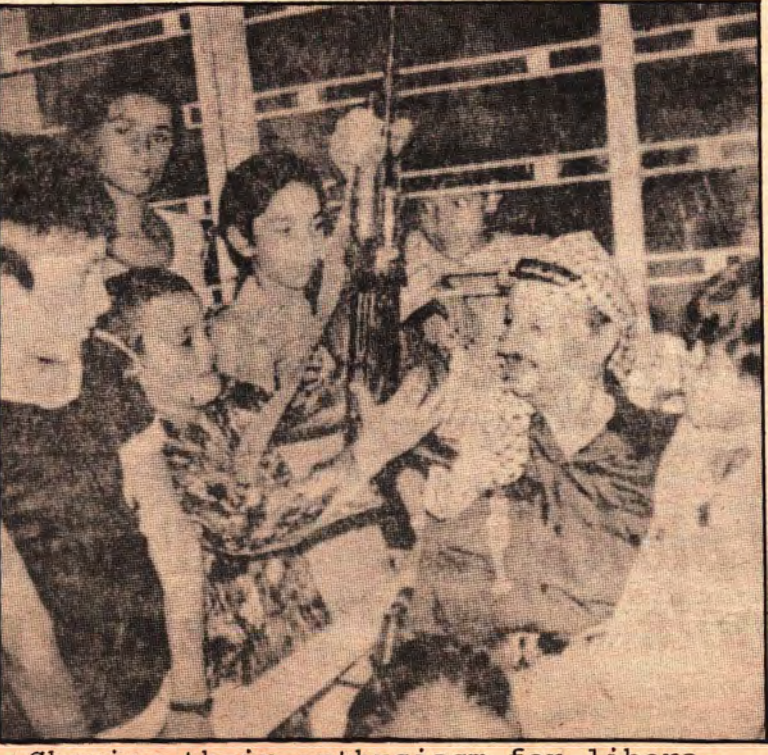
Showing their enthusiasm for liberaation, Palestinian youth crowd around Yasser Arafat, head of the PLO.

Evidence of the real nature of the Soviet Union's "support" for the Palestinian people can be seen clearly in their support for the United Nations Security Council Resolution 242 passed on November 22, 1967. This resolution does not denounce Israeli aggression in the 1967 war or refer to the national rights of the Palestinian people. It does accept, though, the