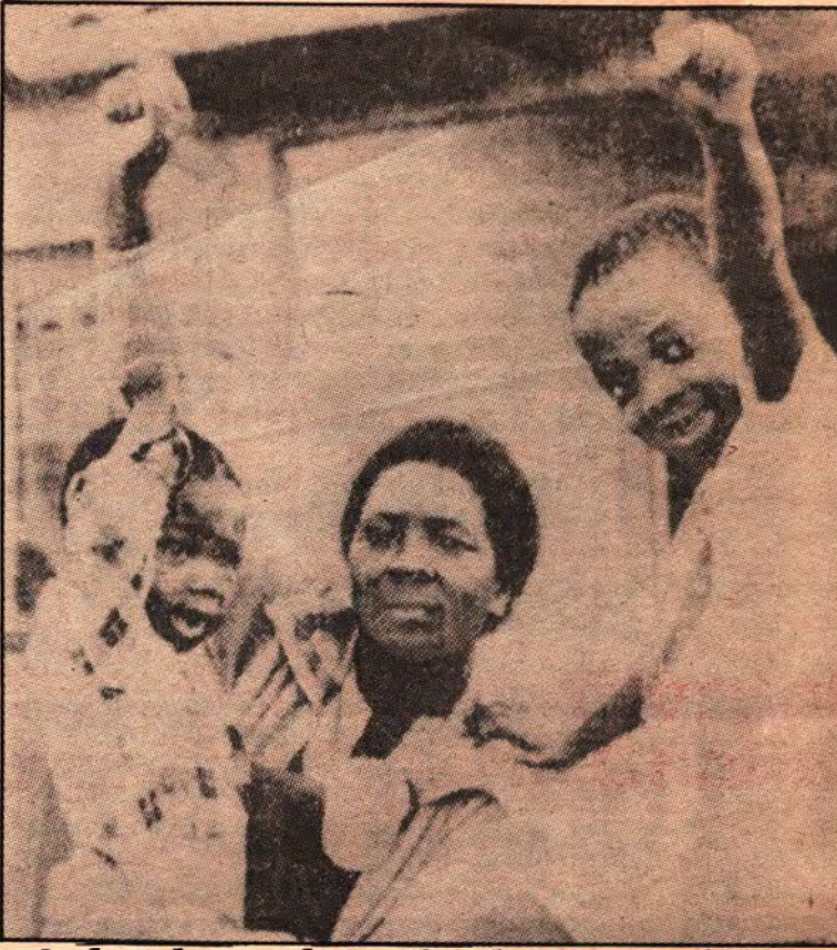
A few days after the death of Biko, his widow Ntsikie and their children display their determination to continue the struggle for liberation.

Nor should we forget here in the U.S. Rather we should take up the call for support of the Azanian people's struggle issued by Steven Biko last December: "We rely not only on our own strength but also on the belief that the rest of the