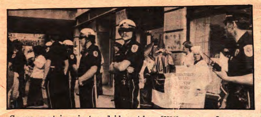
Segregationists like the KKK are always given police protection.