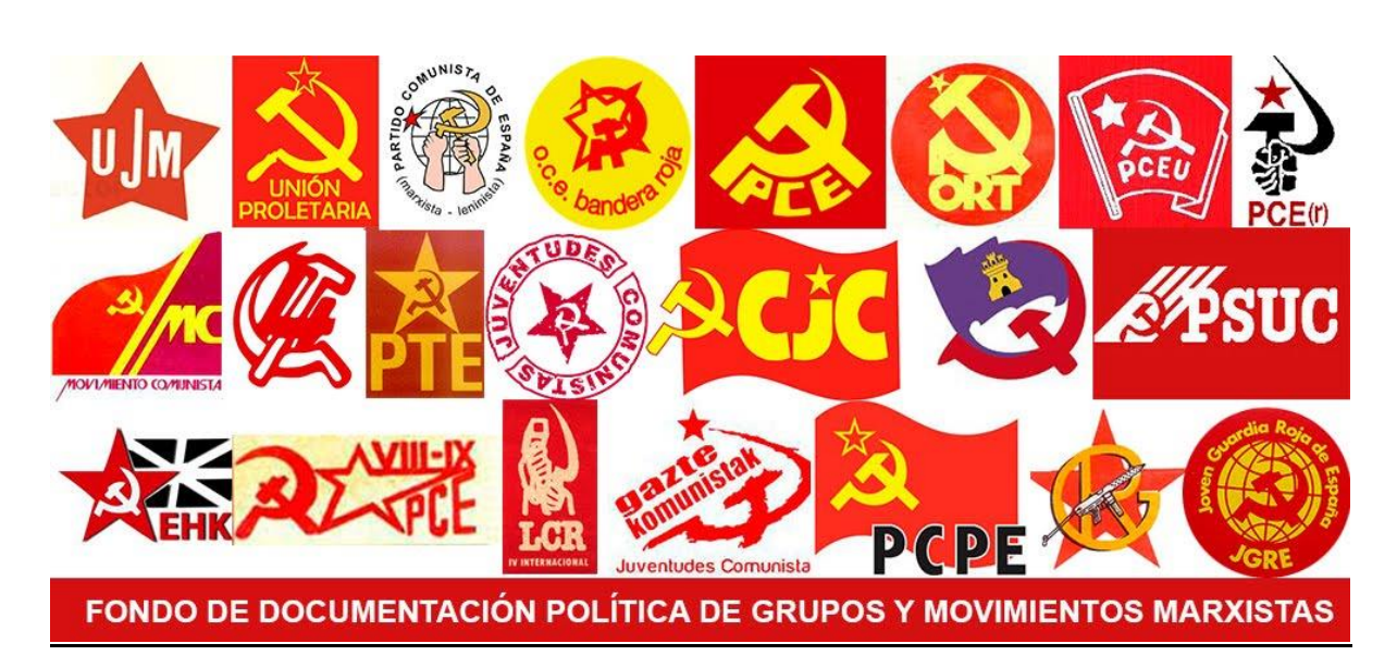
Figure 1 The varieties of Spanish left organisations