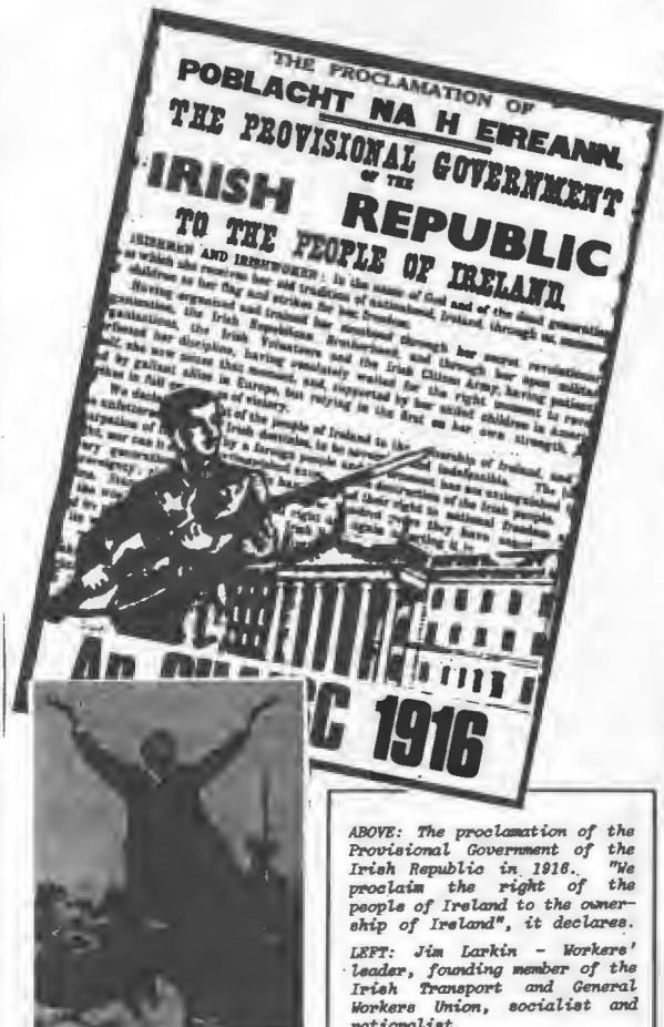
Labour builty has Larkin

is the Republican Movement of proclaims the objective socialism and social uality. It is the Republican of socialism and equality. It is the Republican Movement that puts forward class issues in the community. And it is the Republican Movement: