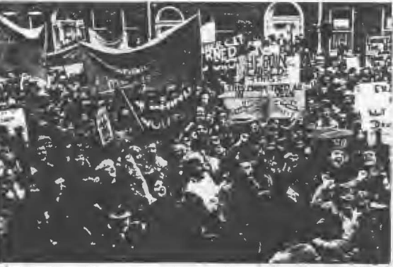
Republican Movement compaigns on all economic and social issues that effect the working class. Their advice centres in working class areas have broad community support and have contributed to the political strength of Sinn Fein. The above photograph shows a dominatration against drugs in the couth. The Republican movement has been active in the campaign which has also confronted state Republican Movement ca opposition.

The 'left' who call for social-ism without nationalism in the ontext of an oppressed nation not only throw out the national struggle, but inevitably sabotage the class struggle. They end up doomed to isolation and defeat. Those who still cannot