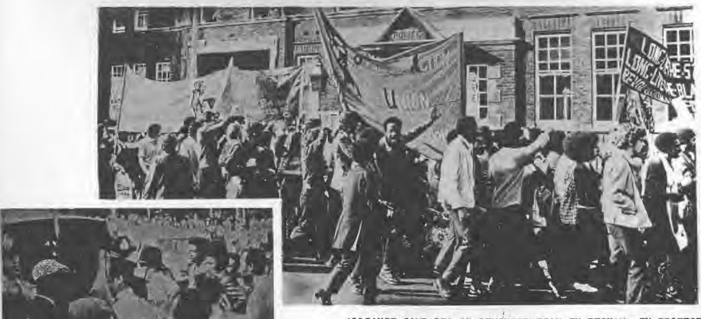
ALLIANCE COMRADES ON DEMONSTRATION IN PECKAM, IN PROTEST AGAINST SAVAGE POLICE ATTACKS AGAINST BLACK YOUTH.

POLICE ATTEMPT TO BREAK UP ALLIANCE DEMONSTRATION IN WOOD GREEN.