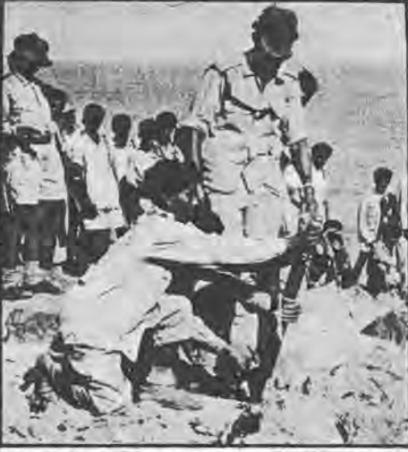
Fighters of the People's Liberation Army of Dhofar

British officers commanding more Through armed struggle against the than 600 mercenaries launched "mopp- British colonialists and their stooand revolutionary people in the Dhofar area under the leadership of the People's Front for the Liberation of the Occupied Arabian Gulf have, in more than six years of national revolutionary war, liberated over 90 per cent of the area's countryside.