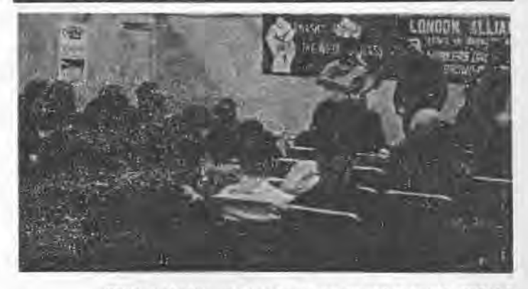
FUND RAISING CONCERT TO FIGHT POLITICAL TRIALS