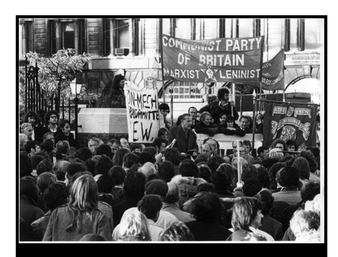
AUEW demonstration in 1973 against the Industrial Relations Act, Tower Hill, London, addressed by Reg Birch.

On 26 January 1971, the union's Executive Committee voted for strike action against the act, calling on all members to act. On 4 February 1971, the AUEW National Committee decided by 63 votes to 5 to call for a series of one-day strikes. On 26 February 1971, more than 150,000 trade unionists marched in London against the Act, a demonstration that the government tried to ignore. On 1 March, two million workers struck for the day, on 18 March, three million.