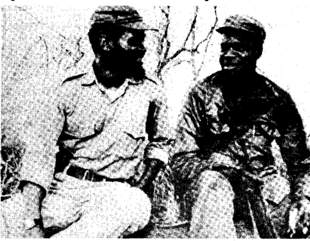
FRELIMO leaders Eduardo Mondlane (left), and Samora Machel in 1968.

proletariat in the Zambian/Zaire copper belt and in South Africa, suggests that the main importance of a revolutionary struggle in Mozambique and Angola would be as a staging area for the struggle in South Africa. In Mozambique there is a sizable number of ex-South African miners who together with those who continue to work in South Africa could provide the links of proletarian internationalism. The vast scope and social power of the black proletariat of South Africa clearly demonstrate the vanguard role they will play in the African revolution, and the strategic importance of the South African proletariat. The