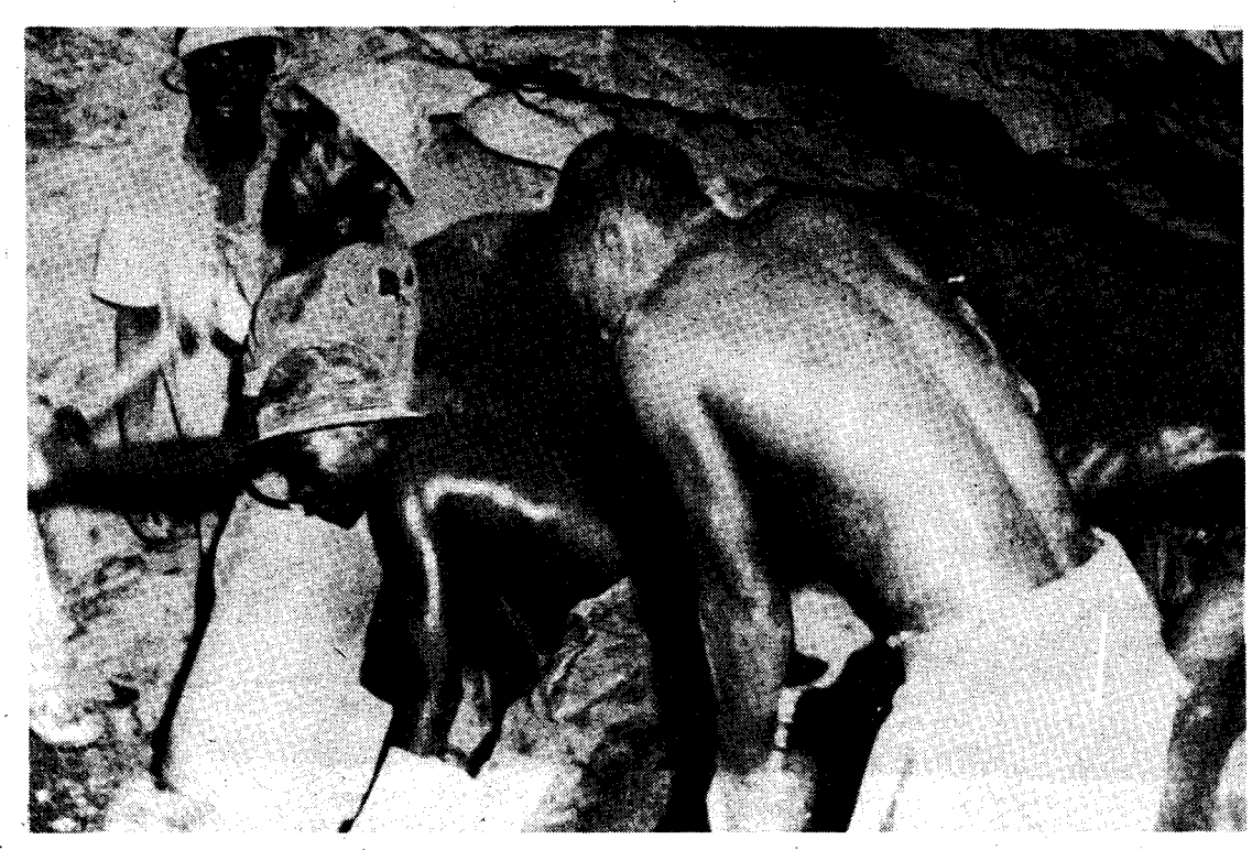
Gold mine workers in South Africa. The South African proletariat has strategic makeut the region.

Of the guerrilla movements in the three colonies the PAIGC in Guinea-Bissau, the smallest and least significant of the territories, has been the most successful. In 1973, the nation- south to the key port of Beira and the