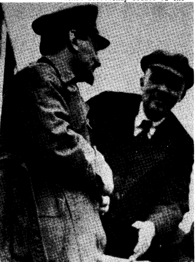
L D Trotsky and V I Lenin at Second Congress of the Third International in 1920.

"The Socialist Workers Party proclaims its fraternal solidarity with the Fourth International but is prevented by reactionary legislation from affiliating to it. All political activities of members of the SWP are decided upon by the democratically elected national leadership bodies of the