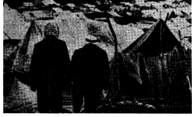
Palestinian refugee camp.

The terrorist action at Ma'alot, for which the DPFLP [Democratic Popular Front for the Liberation of Palestine] took responsibility, was