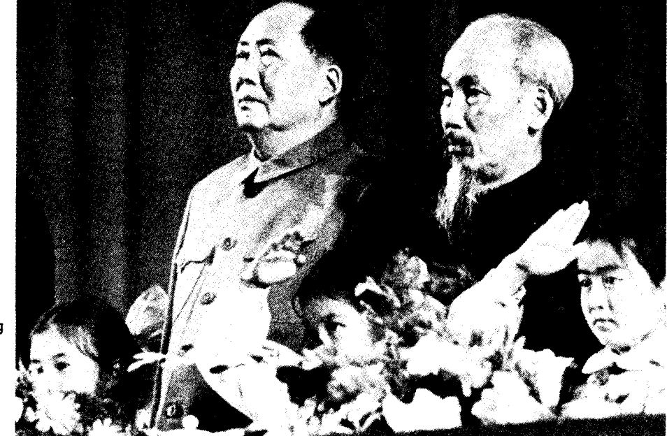
Mao and Ho -- both led peasant armies in overthrowing capitalist rule: both defend national bureaucratic privileges by betraying revolutionary struggles.