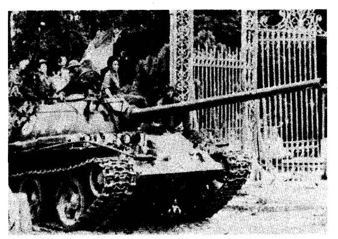
Tank of the liberation forces enters Saigon Presidential

But the military situation was in fact by no means unfavourable. The French had been decisively defeated on the battlefield at Dienbienphu, and as a liberal bourgeois historian has described it, the Vietminh was already dominant in more than three-quarters of Vietnam and was poised to overrun considerably more, and, a month before the Geneva Conference concluded, the French had begun their withdrawal from southern Tonkin. Yet the Vietminh at Geneva agreed to social weight of the peasantry was immense [as evacuate not only the Mekong delta south of Saigon, but also the vast area between the 13th and 17th parallels that had been one of its major political bastions (George McT Kahin and John W Lewis, The United States in Vietnam, revised edition, New York, 1969, pp 47-48). In addition, strong popular opposition to the war in France was preventing the continuation of the French imperialist campaign (already dependent on the US for 80 percent of its funding). The US ruling class had just concluded in an uneasy peace its costly and unpopular war against Korean workers and peasants. The Vietnamese ruling class was in confusion and disarray. Thus, what on the surface appears to be a rather senseless capitulation by Ho in 1954 cannot be explained by reference to the objective relation of forces, but