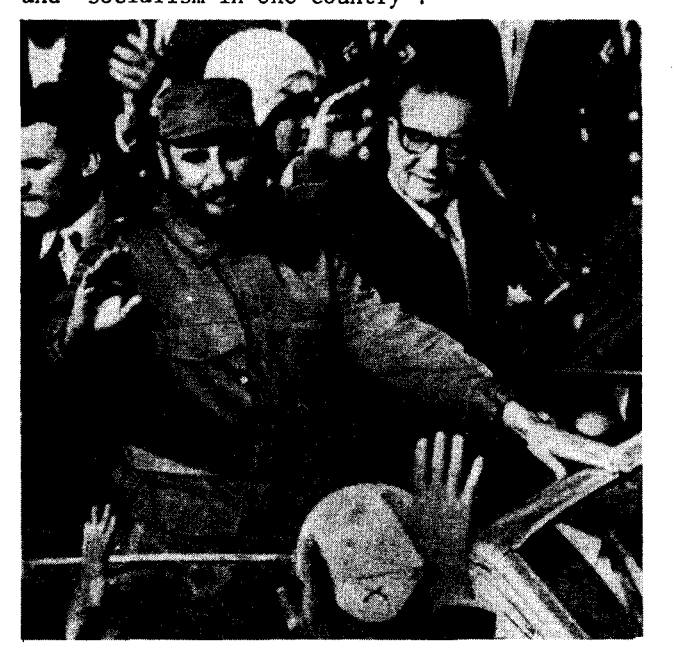
Cuba's "unconscious Marxist" backed Allende.

For the revolutionary vanguard internationally, the crucial question posed by the recent developments in Indochina is that of the programmatic and strategic conclusions to be drawn from the setbacks dealt to international capitalism. Leninism holds that the destruction of the bourgeois state and the creation by the workers of their own state capable of laying the foundations for socialism requires the mobilisation of the proletariat behind a vanguard workers' party based on Marxist internationalism. Yet in Vietnam and Cambodia, capitalist property relations have been smashed by peasant-based forces led by Stalinist parties, communist in name only, with a long record of class collaboration and betrayal, committed to the anti-Marxist doctrines of "peaceful coexistence" of the workers states and capitalism on a world scale and "socialism in one country".