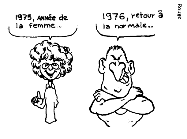
USec "Cartoon" reprinted in NZ Socialist Action, depicts "men as the enemy" by caricaturing most backward elements of the working class.