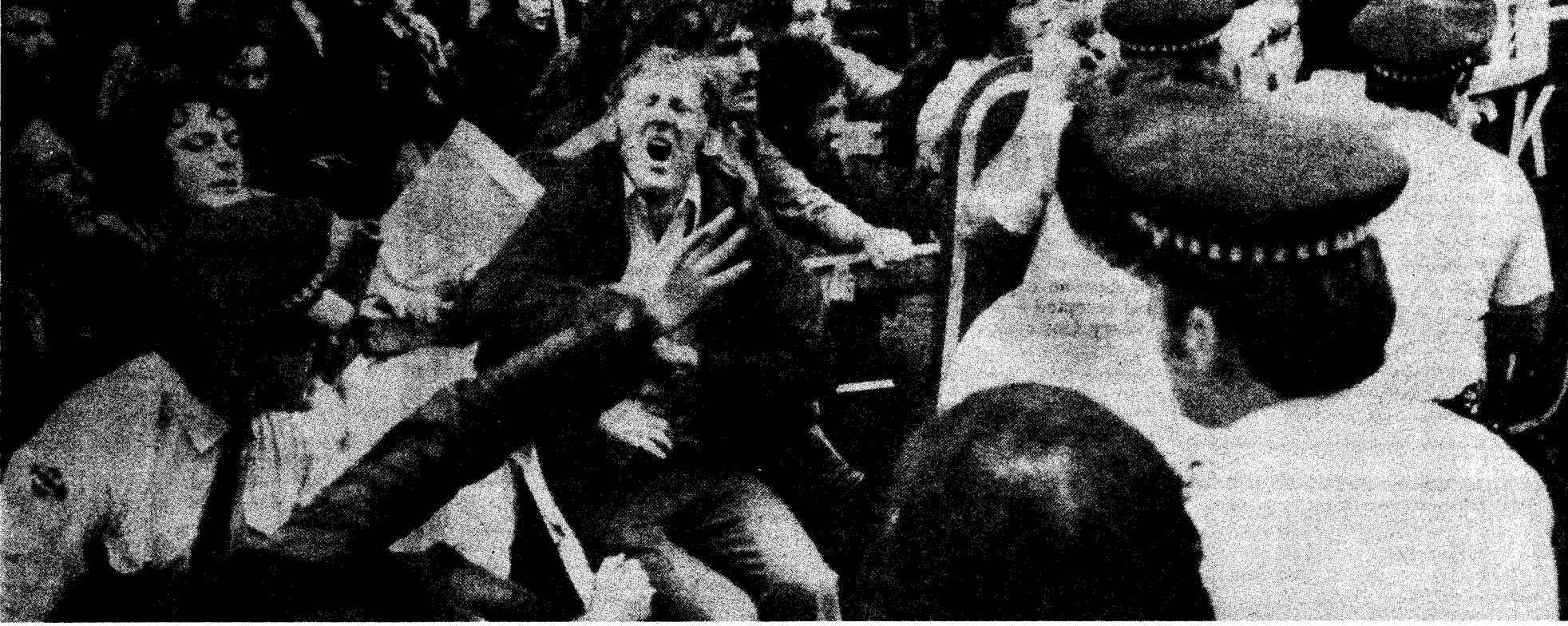
Police attack anti-Fraser march on its way to Labor Party rally in Hyde Park, Sydney, 24 October.