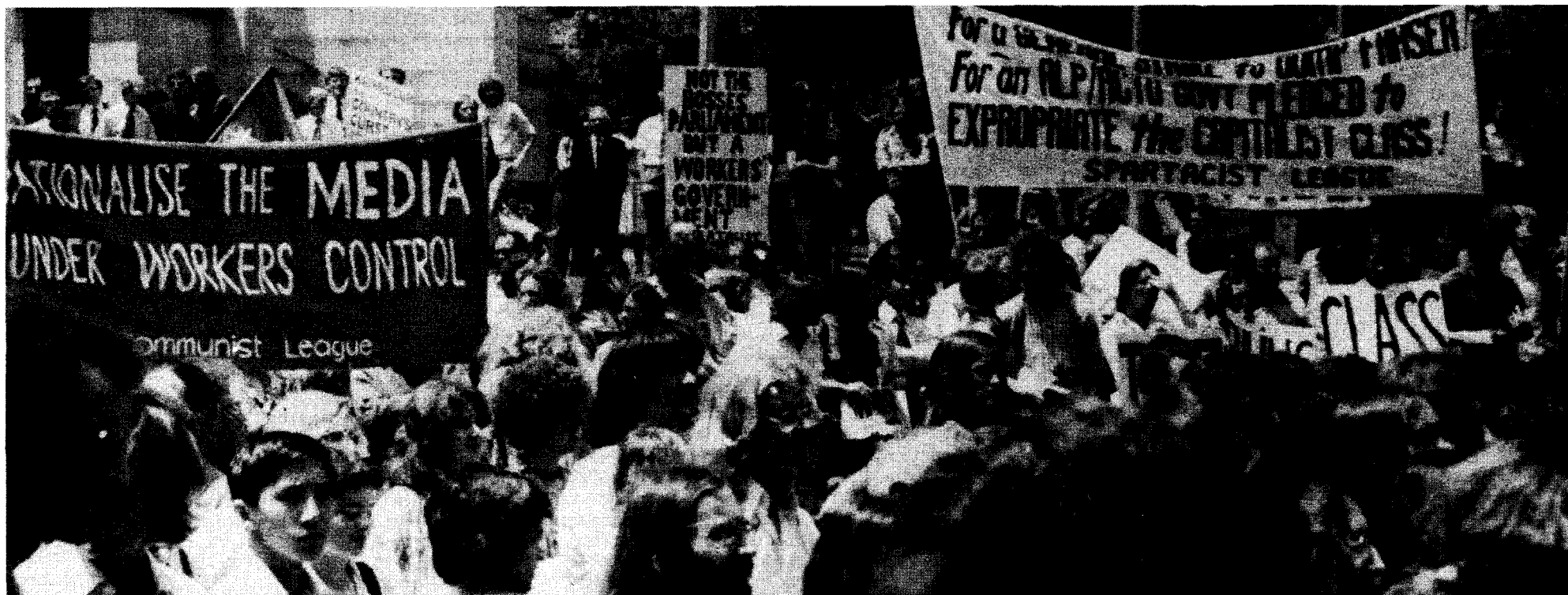
Rally in support of the Labor Party, Hyde Park, Sydney, 13 November.