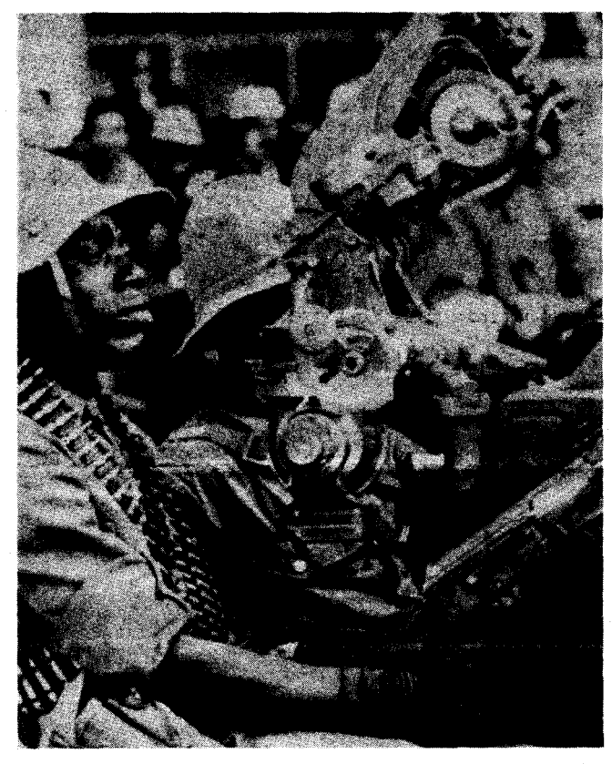
MPLA soldiers with Soviet-supplied heavy anti-aircraft gun

The "precise class content" of the MPLA's occasional demagogic talk of "end[ing] exploitation of man by man" was graphically illustrated by its suppression of workers' strikes. Following the overthrow of the Caetano dictatorship in April 1974 and again as the "transitional government" was being installed and independence seemed to be approaching, Angolan workers launched major strike waves in the hope of obtaining some improvements in their own lot. The strikes focused on the key dock facilities. In the spring of 1975 it was estimated that "in the ports of Luanda, Lobito and Mocamedes...about 60 ships