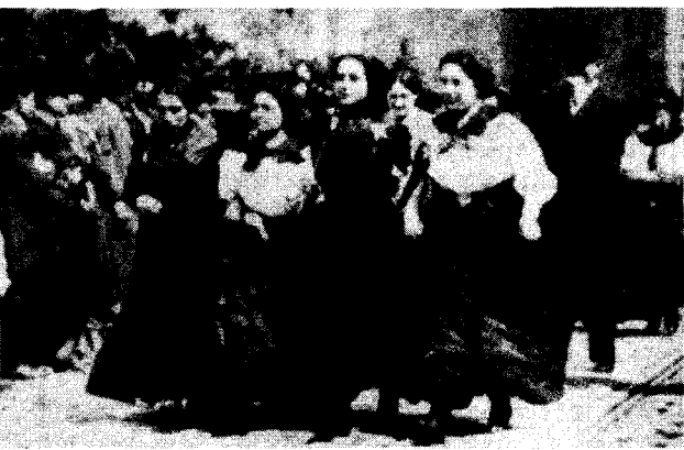
Garment workers during 1919 strike.

"There is only one movement; there is only one organization of women communists within the Communist Party, together with male communists. The tasks and goals of the communists are our tasks, our goals. No autonomous organization, no doing your own thing which in any way lends itself to splitting the revolutionary forces and diverting them from their great goals of the conquest of political power by the proletariat and the construction of communist society.' -- Clara Zetkin, 1921