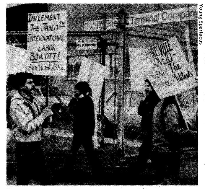
Demonstrators protest against unloading of South African ship at San Francisco pier, 18 January.

Trailing right behind the bureaucrats and their liberal strategy are the pseudo-Trotskyist Socialist Workers Party (SWP) and Communist League (CL), who cohabit the Pabloist "United"