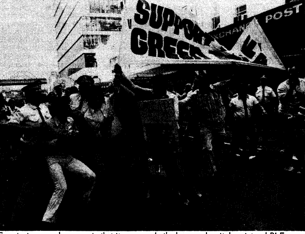
Commission proved once again that it serves only the bosses when it deregistered BLF, allowing the militant NSW branch to be smashed. Fraser's IRB will re-activate and extend hated penal powers of Arbitration.