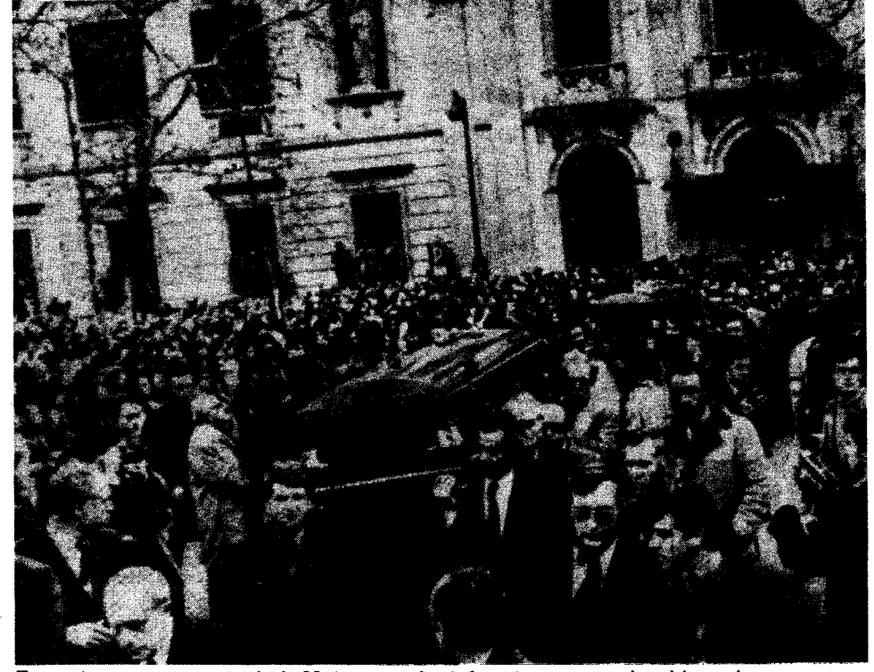
Funeral procession in Madrid, 23 January, for leftist lawyers murdered by right-wing gunmen. Workers' outrage must be channelled into struggle for state power.

In the 15 months since the death of Generalissimo Franco, Spain has been convulsed by tempestuous and escalating social struggles which threaten not only the stinking remnants of the Francoist regime but the rule of capital itself. As the intensity of the class struggle has mounted so have the terrorist activities of the multitude of officially protected fascist bands and ultra-rightist death squads.