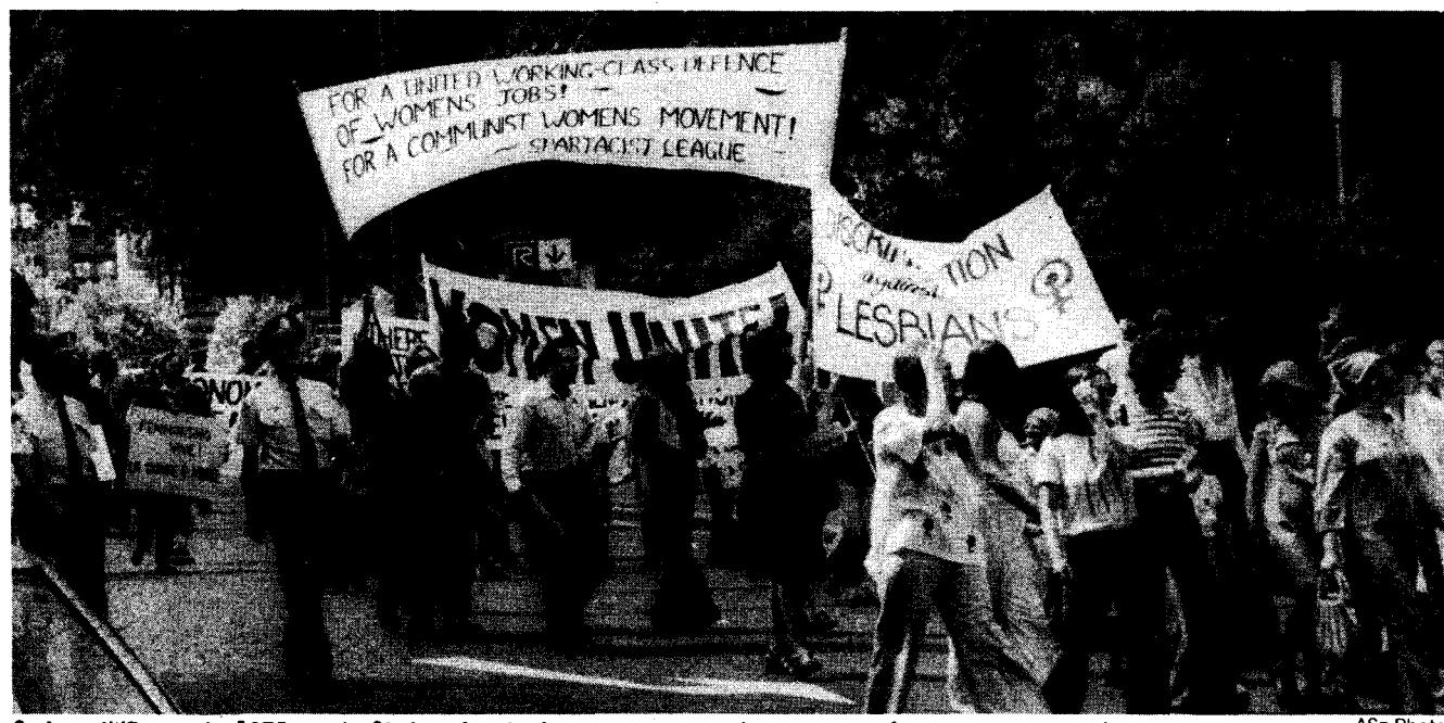
Sydney IWD march, 1975: only SL has fought for a communist alternative to feminism in women's movement.

Once again ... we're taking to the streets" -- thus begins the call for this year's International Women's Day (IWD) march in Sydney. But the forced nostalgia rings hollow amidst the deep-going malaise which permeates the feministdominated women's liberation movement (WLM). And the stale promise that women's liberation will come "only" with the "involvement of large numbers of women" no longer sounds very convincing to large numbers of disaffected activists.