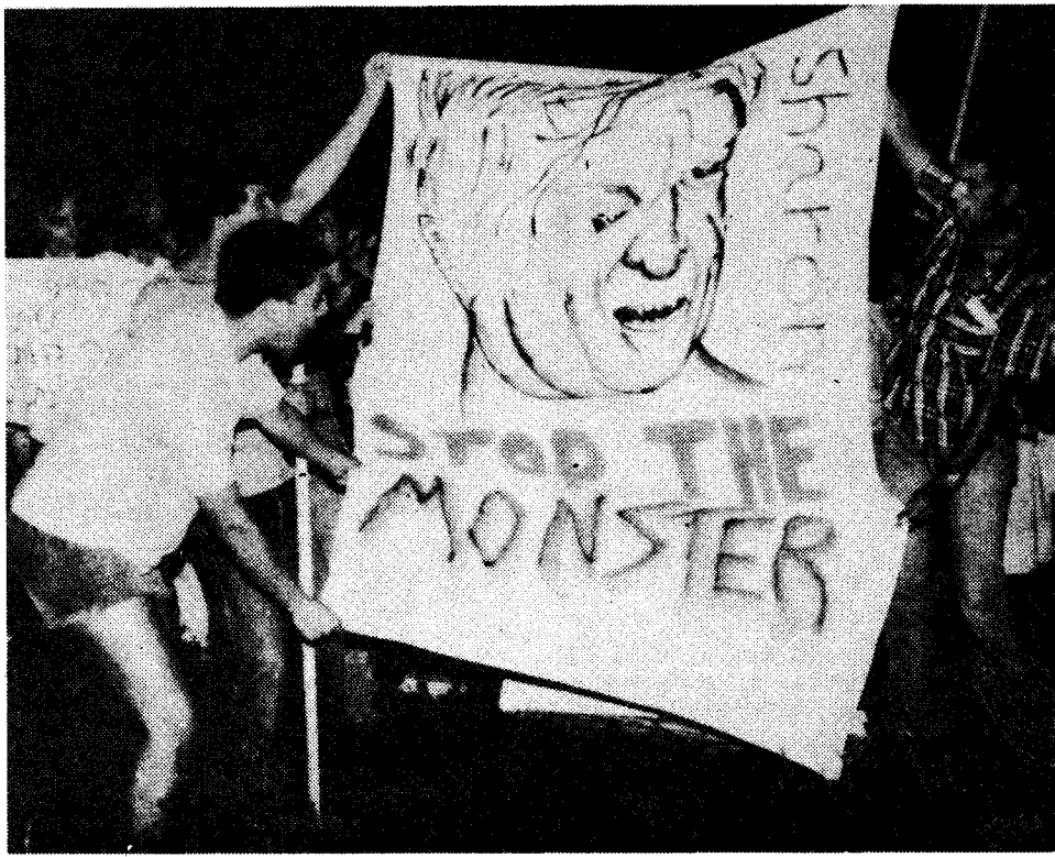
Furor over Shatila-Sabra shakes Israel

WV: Well, was this phone call and Reagan's subsequent peace plan, which was very much like the Labor Party plan, is this seen in Israel as pressure to put the Labor Party in the government?