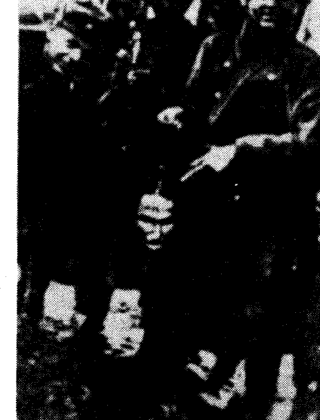
Israeli Blitzkrieg links up with Haddad forces in southern Lebanon: local pogromists used for the dirtiest jobs, as was Hitler's Croatian Ustashi (right)