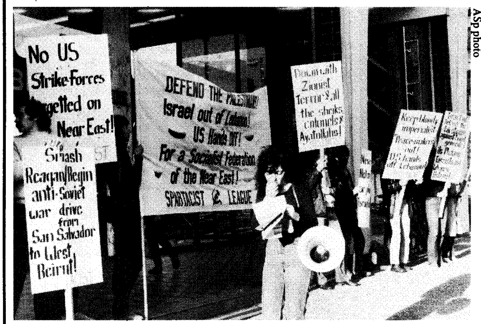
21 September — Spartacist League protests Zionist Holocaust at Sydney's Israeli consulate. From New York to San Francisco, from Toronto to Paris, sections of the international Spartacist tendency initiated or marched in demonstrations protesting the Zionist-sponsored massacres at Shatila and

Reprinted below is the text of the 21 September Spartacist League press release.