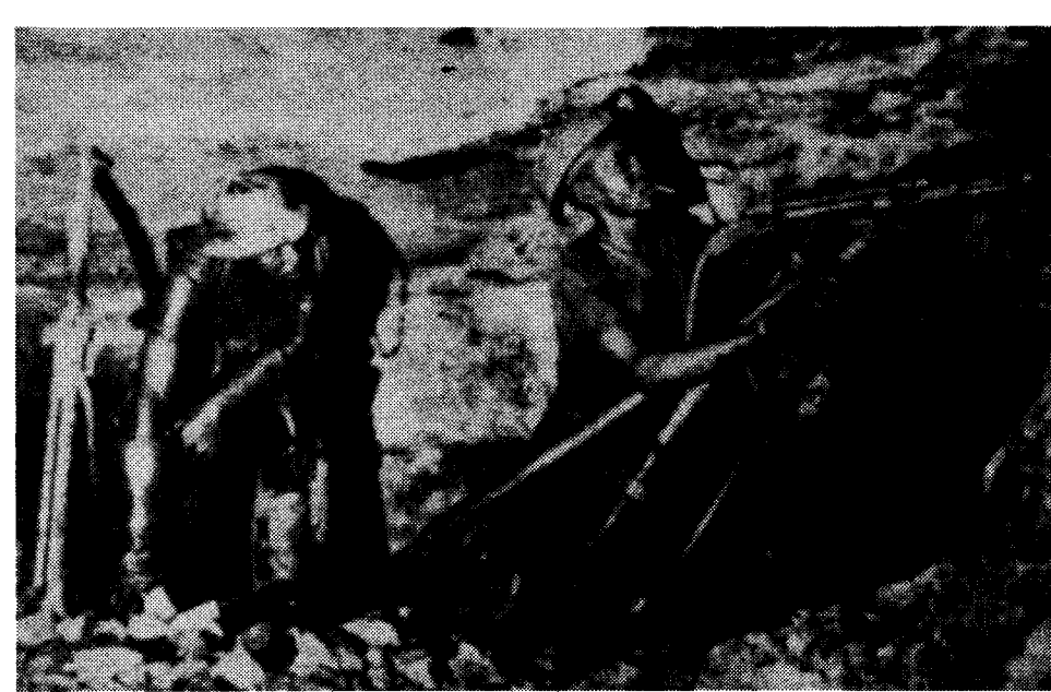
Apartheid capitalism rests on superexploitation of black workers, especially in the gold and diamond mines.

Meanwhile an important battle was developing on the Port Elizabeth docks,