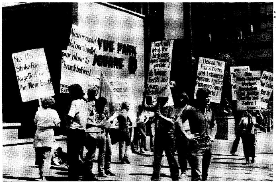
SL pickets US consulate. Our opposition to imperialist troops in Lebanon sharply polarised the PLO nationalists and their Laborite-liberal hangers on

"The imperialist troops are going back now to the Near East to ensure that their Israeli butchers can accomplish their goals ... to allow the Israeli butchers to rearm ... to ensure that imperialistcapitalist oppression of the Palestinians and barbaric national oppression of the Palestinians and all the toilers of the Near East is continued. The imperialist powers are going back to ensure that the Near East remains a beachhead for anti-Soviet war. We say: imperialist troops get out of